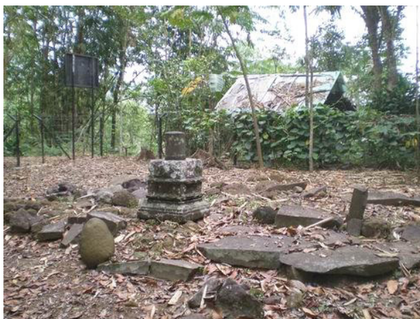
Figure 2. Lingga Yoni Kampung Sindanglengo, Sukamaju Kidul, District Indihiang, Tasikmalaya