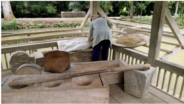
Figure 1. Lisung-halu and jubleg in Saung Lisung Kampung Naga-Tasikmalaya