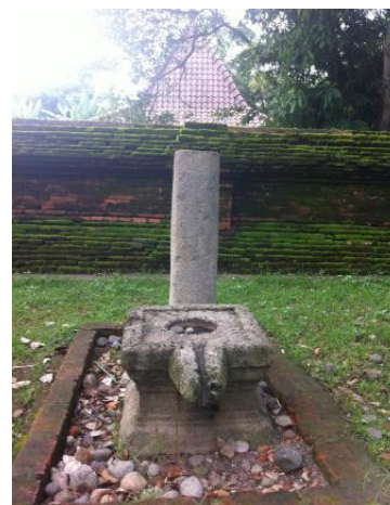
Figure 3. Lingga Yoni in the complex of Sitiinggil Keraton Kasepuhan, Cirebon

Carl Gustav Jung formulates the collective unconsciousness as a universal element, derived from generations, not individuals. This element is very difficult to realize. The collective unconsciousness contains what he calls the archetypes. The three most important archetypes according to Jung are anima, animus and shadow. Anima is a female archetype in man, animus is a male archetype in woman, and shadow is animalistic archetype or also called the evil side of man. Other archetypes include archetypes of father, mother, child, hero, girl, wise parent, God, and so on. In this study, the discussion of lisung as the personification of women in the world's top in the world view of agrarian Sundanese, will be limited based on the archetype of mother, anima and animus. The archetype of mother is described as the innate abilities that exist in man over all matters relating to the maternal because every human being comes from an environment that involves the mother figure and role. Jung assumes that these innate conditions and abilities can be projected into a clearer world or figure. Even when the reference figure of mother does not exist, humans will still concrete it by personifying archetype on mythical figure. Anima is a female archetype in man. And animus is a male archetype in woman.