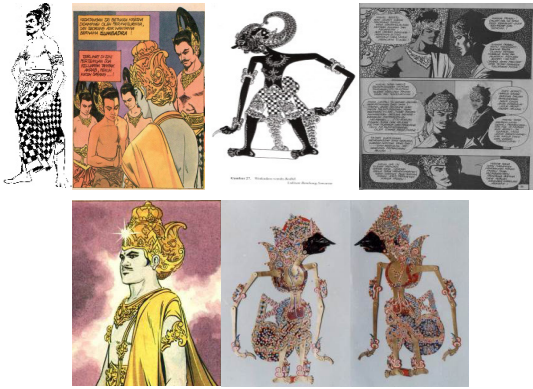
Figure 3. (From left to right) Visualization of Bima in Ananda version, Misurind and the wayang kulit version. The comparison between Kresna and Karna on Ananda version, Kresna typical appearance in Misurind Version, and the comparison between wayang version of Karna and Kresna both as satria lanyap in wayang kulit Surakarta. (Source: personal documentation, Suwarno (1999), dan Ahmadi, (1994))

which characterization is an example of the combination between the two elements as well as the main aspects. Comic story can work and succeed because of the characterization, how it was developed visually and nonvisually. This is in line with the art of wayang that prioritizes character and characterization.