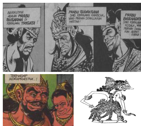
Figure 6. Various visualization of opposition kings in Ananda and Misurind versions, and graphic illustration of gusen wayang character as representation of evil and rough characters by Soelardi from the book Serat Pedhalangan Ringgit Purwa .

This paper is a study of art and culture, especially in the realm of art, based on qualitative-descriptive research that contains interpretations. Visual adaptation of the protagonists and antagonists of the Teguh's wayang comic is the focus of the discussion in this paper, compared to the Javanese wayang kulit images as well as the wayang golek and wayang wong costumes which are assumed to be the main reference. The elements analyzed are the comic visual style, including the depiction of anatomy and its ap-