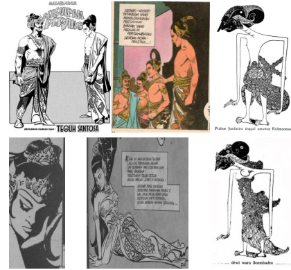
Figure 4. (from left to right) Yudistira in Ananda version, Misurind and the wayang kulit version. Visualization of female characters like Sumbadra, which is based on graphic image of wayang Putren luruh od Surakarta in the book of Hardjowirogo.

As a product of traditional art, wayang puppets - especially wayang kulit - have patterned visuals as a system, which can be divided into several categories according to the characteristic traits symbolized, namely: (1) Raksasa (Giant), biggest, big-eyed, open-mouthed and fanged, symbol of rude and ignorant nature; (2) Bapangan (Half giant), giant transitions into humans, grinning mouths ( gusen ), cruel, large bodies, for example Dursasana, Buriisrawa; (3) Gagahan (strong warrior), large, well-built, glaring eyes, bearded with mustache, brave and strong, for example