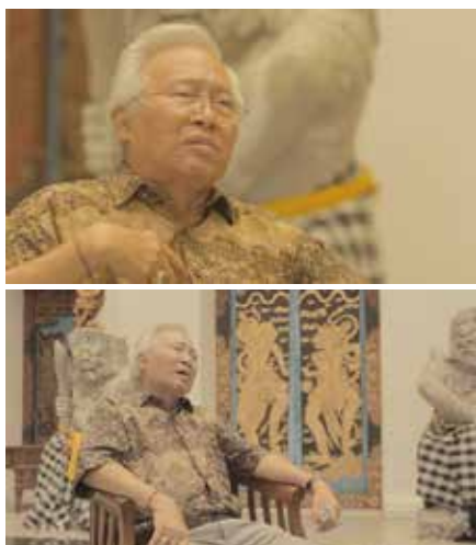
Figure 1. Several shots on screen that place objects on the right or left side.

can cut some pictures from the whole space. The appeared space in the frame is called the space on screen. While the space that is not visible in the space is called off screen. In this documentary, the object was always in frame. Placement of objects for interview was placed on the right and left. While there were some frames for the insert image placed in the middle of the frame.