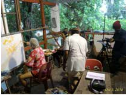
Figure 3. The movement of the tracking shot camera assisted by a slider

age and the shooting of painting detail. The cameraperson took images with still techniques and there was also camera movement.