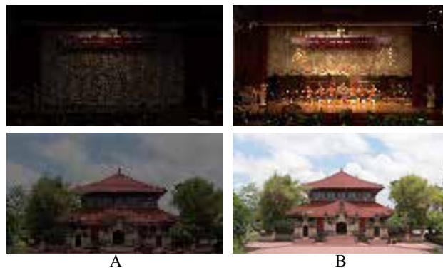
Figure 8. The form of fade editing, movement of image from A with the darkens intensity of the image and then it appeared to B