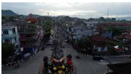
Figure 5. Overhead shot camera angle