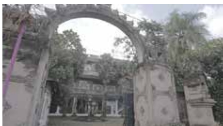
Figure 9. Establish shot of Gunarsa movie