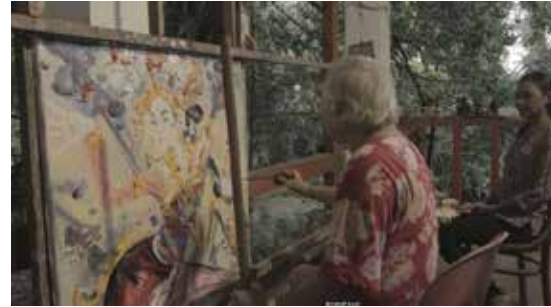
Figure 4. Dynamic composition

The camera angle was also a concern of the director. The camera angle is the viewing angle of the camera towards different objects in the frame. From the three camera angles that is high angle, straight-on angle and low angle, in cinematography of this documentary movie used the