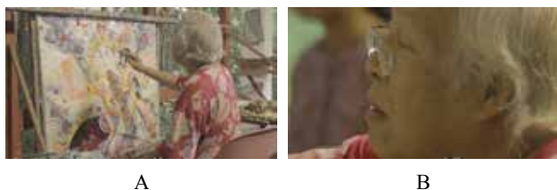
Figure 10. Cut-in editing, transitions of far shot (A to a closer shot (B)

Simplify the editing process, two cameras were used simultaneously that set image quality and color through the settings of contrast, brightness, color. Images can be arranged dark and light, the color of the lighter and darker, it depends on the aesthetic demands. The contrast and brightness of the movie depends on the movie theme and genre. This documentary used contrasting and brighter aspects, different from horror fiction movie that tend to be dark. This aspect was used with cinema mode to get the classic and impression of a more classic and cinematic movie. The yellowish tone was chosen to match the background of this documentary story nuanced “nostalgia” (soft), that is to retell how the process of creating the “Barong” painting, by Gunarsa. Yellow had a distinctive coloration with contrast and calm nuance.