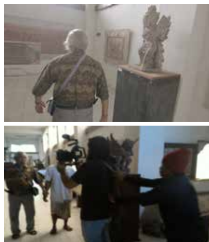
Figure 2. Shot that used handheld camera to give a realistic impression