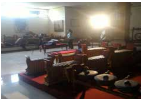
Figure 6. The use of lighting in interview shooting