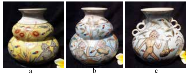
Figure 6. Bottle vase with its various shapes and ornaments.

Rahwana. A terrifying fight happened to take Dewi Sita away. This battle was won by Rahwana that was done by cutting Jatayu's wings until he finally fell to the ground. The meaning of tolerance that can be explained by the occurrence of the puppet story is to help anyone without seeing the identity of the person being helped. The help must be done sincerely as it is an obligation that should be done by everyone. It has been done by Jatayu who was mandated by his ancestors. This story gives the moral lesson that helping others should be done sincerely. We should not see someone's identity from his or her religion, beliefs, origins of birth, wealth, and others. The main thing is by helping the others who really need help. The message of tolerance contained in the story above is very deep and good to be used as a guide in living the community life in Indonesia. Therefore, peaceful circumstance is created in the plural community atmosphere. Indonesian people in some places are frequently lack of concern for others and still prioritizing the individualism in society. It is reflected in electronic media showing that often display various violence and bombings that cause many victims. Moreover, it looks like there is no regret from the perpetrators.