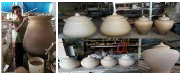
Figure 1. The formation process (above) and several artworks in the drying process (below) in Tri Surya Keramik.