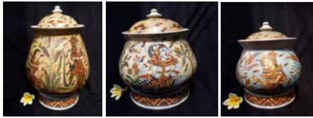
Figure 3. Several sangku variations with Balinese puppet style ornament