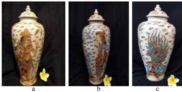
Figure 4. The third variant of the vase, the figure a and b is the same work, while figure c has the same ornament as Jatayu.

anyone can be in power, but it must be obtained based on the applicable law. Everyone has the same rights and obligations above the law in obtaining power. Obeying the law means obeying tolerance, respecting others' rights and obligations, and not imposing themselves. Thus, the peaceful society can be realized.