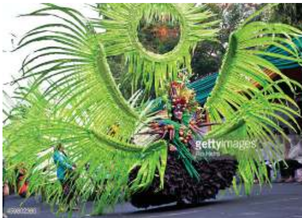
Figure 13: Carnival costumes, BEC 2, 2014

Some examples of Banyuwangi Ethno Carnival costumes as an adoption of Culture diapora development from JFC carnival are shown in the pictures below.