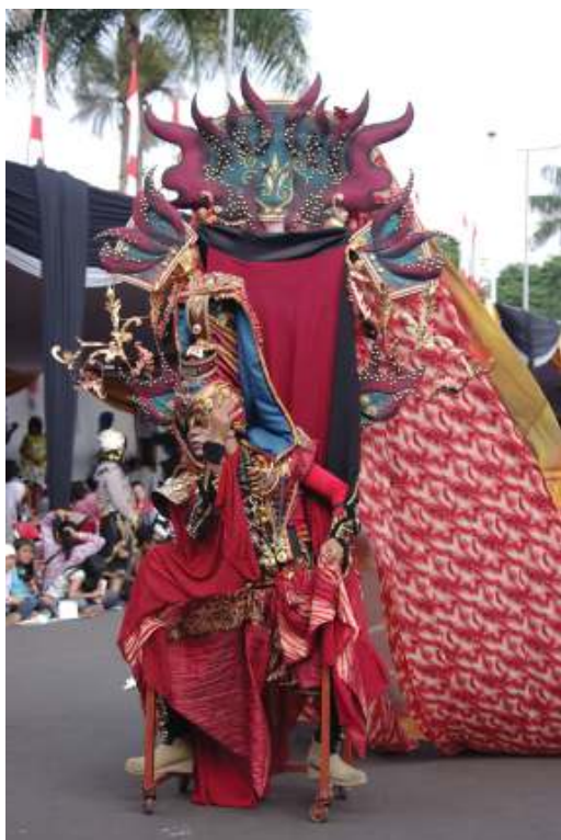
Figure 9: Carnaval Costumes Sub Theme Sub Tema Tambora, JFC XIII, 2014