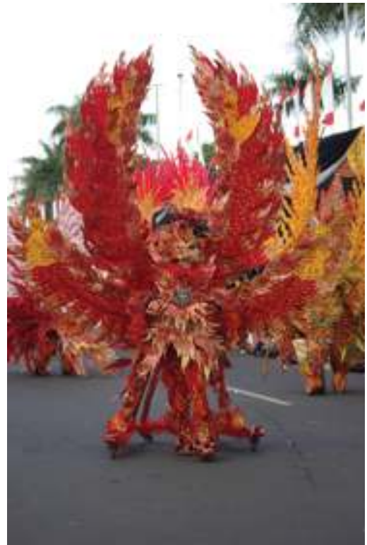
Figure 7: Carnival Costumes Sub Theme Sub Tema Phoenix, JFC XIII, 2014