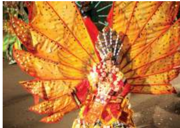
Figure 25: Costumes JFFF, 2012

Generally, JFFF does not have long carnival in the streets, just goes around several buildings and it is conducted more in the indoor space. The costumes shown come more from the festival participants who come from other cities and donations of the JFC inspirators.