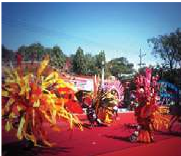
Figure 20: Carnival costumes 3, Bayuanga Batik Carnaval, 2012