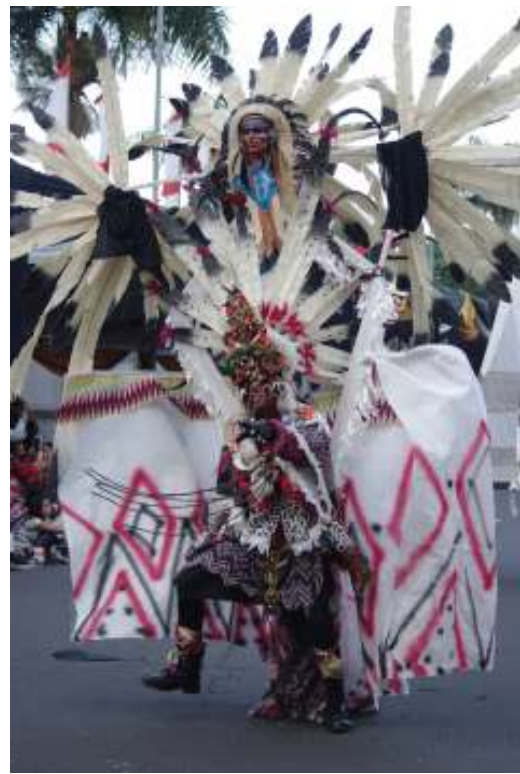
Figure 8: Carnival Costumes Sub Theme Sub Tema Apache, JFC XIII, 2014