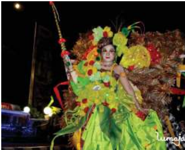
Figure 16: Carnaval costumes Lighting 2, LOSC, 2012