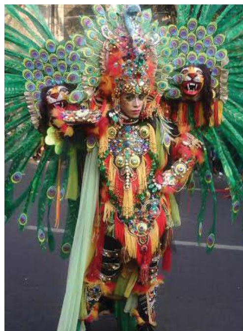
Figure 12: Carnaval Costumes Sub Theme Reog, JFC XIV, 2015