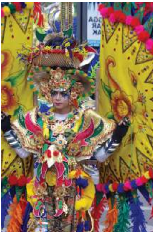
Figure 6: Carnival Costumes Sub Theme Betawi, JFC XII, 2013