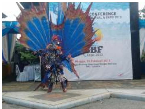
Figure 30: Costumes Belitung Beach Festival 2, 2013