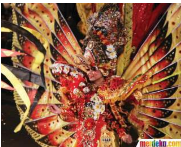
Figure 25: Costumes JFFF, 2013