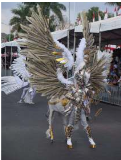
Figure 10: Carnaval Costumes Sub Theme Pegasus, JFC XIV, 2015