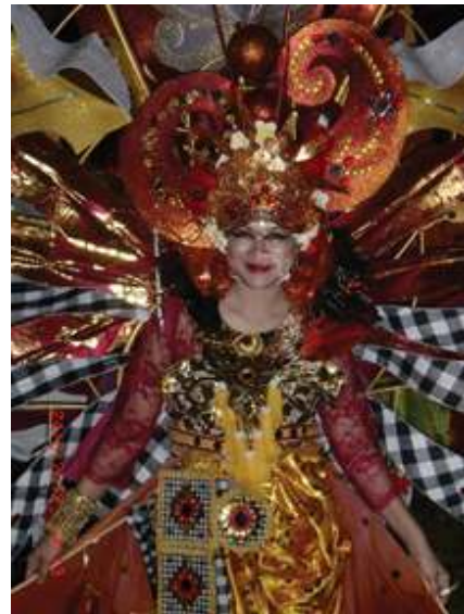
Figure 18: Carnaval costumes 1, BBC, 2012

Some examples of Bayuangga Batik Carnaval costumes in Probolinggo as a result of Culture Diaspora development taken from JFC carnival.