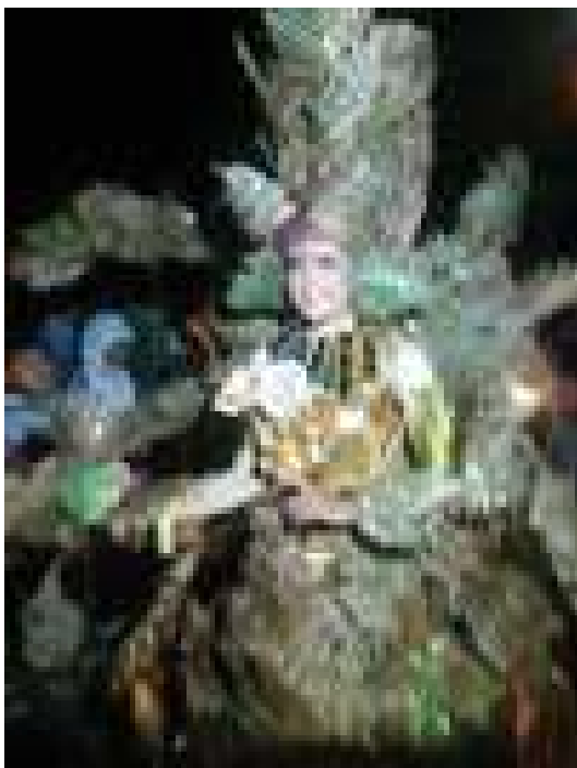
Figure 17: Carnaval costumes Lighting 3, LOSC, 2012

The city of Lumajang holds fashion carnival at night so the lighting technology presents the elements that clearly shows the costume creation. Culture diapora appears in Lumajang city with a different shape