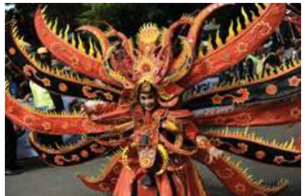
Figure 12: Carnival costumes Kebo Geni BEC 3, 2013

Carnaval costume as culture diapora held in Banyuwangi is different from JFC. The costumes shown in BEC promote the local art tradition that is rich in folklore.