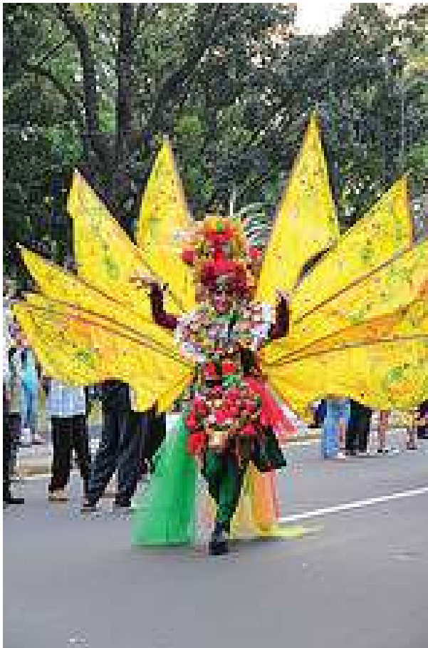
Figure 24: Costumes JFFF, 2013