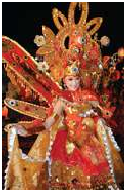
Figure 21: Carnival costumes, SBC, 2012

The design of Batik from Probolinggo becomes the theme that is used in this city's costumes carnival. Some examples of Solo Batik Carnaval as the development of Diaspora culture from JFC carnival: