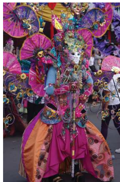
Figure 4: Carnival Costumes Sub Theme Venice, JFC XII, 2013

Some examples of costumes in Jember Fashion Carnival as the development of Culture Diaspora found in Rio de Janeiro and the carnivals in the other countries.