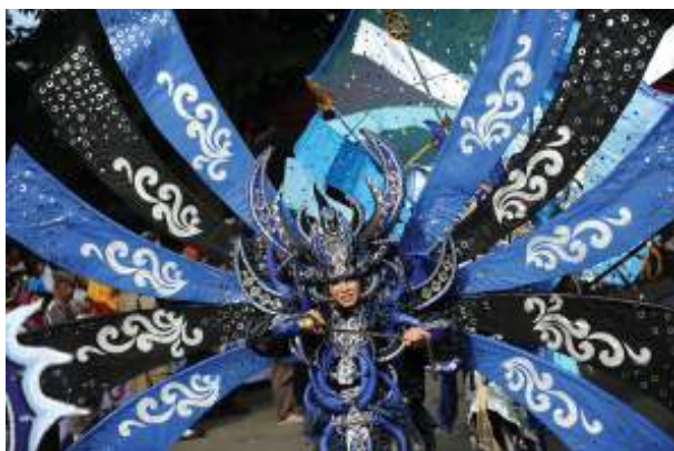
Figure 14: Carnival costumes Kebo Bumi, BEC 3, 2013