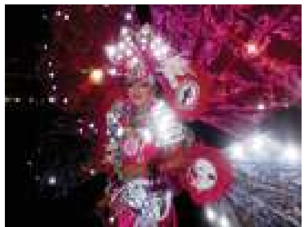
Figure 15: Carnival costumes Lighting 1, LOSC, 2012

Some examples of Lumajang On Shine Carnival costumes as an adoption of diaspora culture JFC: