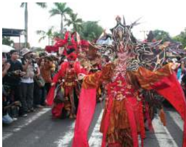
Figure 22: Carnival costumes, SBC, 2009