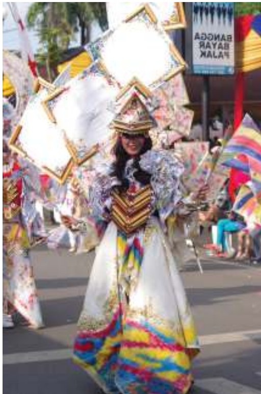
Figure 5 : Carnival Costumes Sub Theme Canvas, JFC XII, 2013