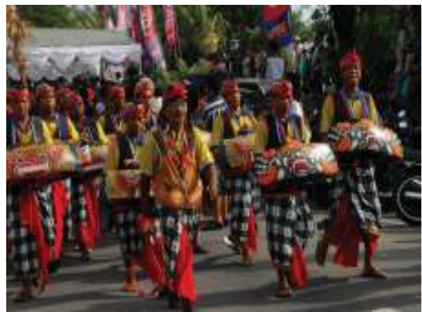
Figure 26: Costumes Kuta Carnival 4, 2014

Some examples of Kuta costumes carnival come from Bali as a result of Culture Diaspora development taken from carnival JFC: