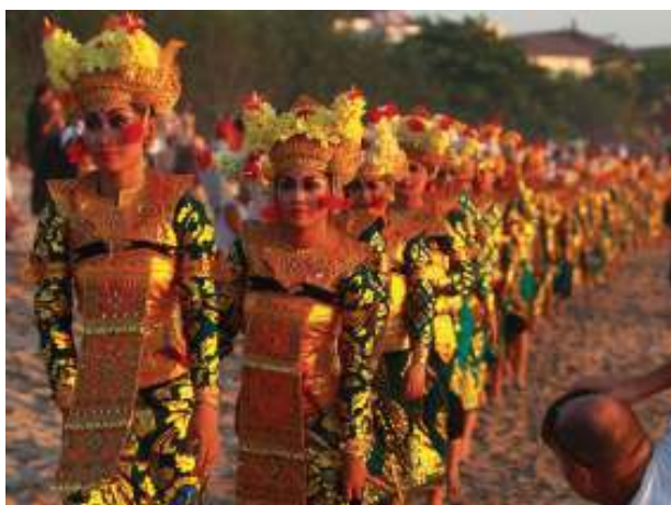
Figure 28: Costumes Kuta Carnaval 2014

The Balinese tradition is clearly seen from the procession and its costumes that strongly shows the traditional nuances of Bali.