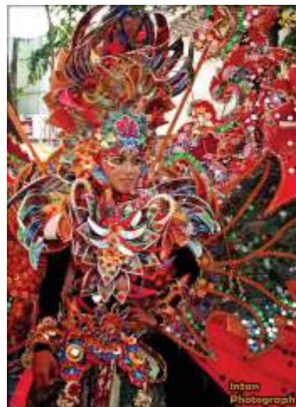
Figure 19: Carnaval costumes 2, Bayuangga Batik Carnaval, 2012.