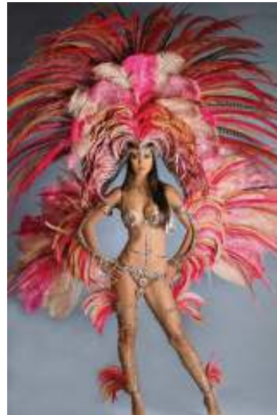
Figure 3: Tobago n' Trinidad, Karibia Costumes

Some examples of costumes in Jember Fashion Carnival as the development of Culture Diaspora found in Rio de Janeiro and the carnivals in the other countries.