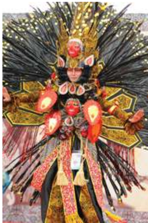
Figure 23: Carnival costumes, SBC, 2012

The design of Batik from Solo became the characteristic that is strongly found in the creation of the costume carnival.