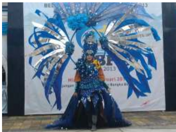
Figure 29: Costumes Belitung Beach Festival 1, 2013

Some costumes from Belitung Beach Festival is found to be the development of Culture Diaspora Kultur that is taken from JFC carnival: