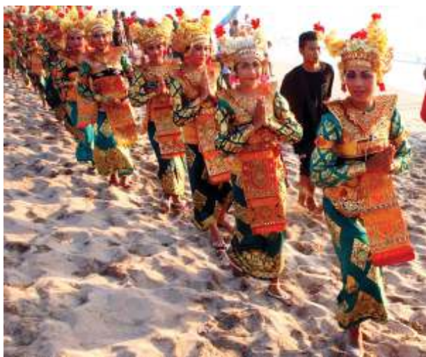
Figure 27: Costumes Kuta Carnaval 4, 2014 Source: http://whB9QM&ei=n_sVf-iMIqMuATWw5ygDA&tbm=isch&ved=0CEEQMygaMBpqFQoTCL_uj_zv6cYCFQoGjgod1iEHxA , diunduh 19 Juli 2015