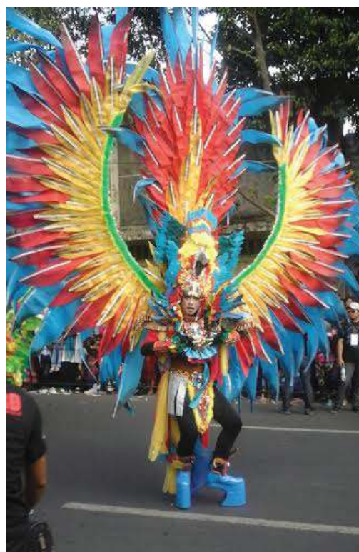
Figure 11: Carnaval Costumes Sub Theme Parrot, JFC XIV, 2015