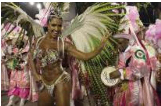
Figure 1: Carnival costumes of Rio de Janeiro, Brazilia

Some examples of costumes from Rio de Janeiro, Brazil dan Tobago n' Trinidad, Karibia that inspire Fariz for JFC can be seen below: