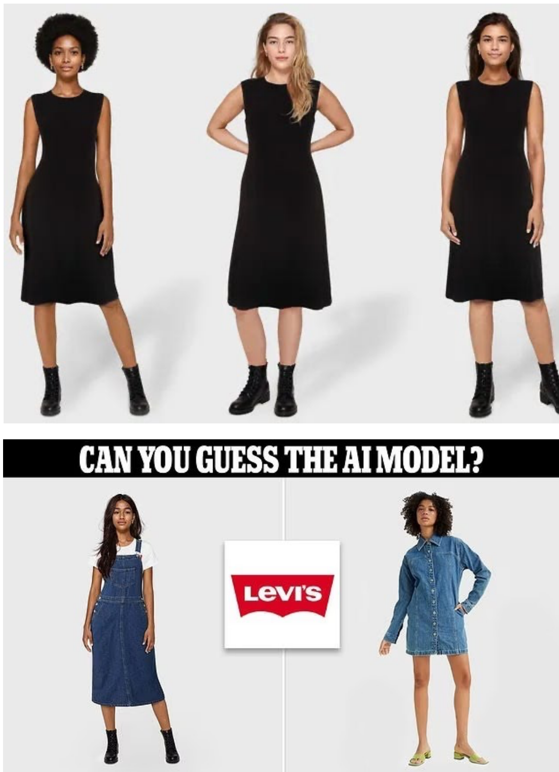
Figure 3 and 4. The models in Levi's fashion product advertisements were created using AI technology. AI technology can visualize hyper-realistic models, hoping customers can choose the desired fashion items that suit their desires, whether in terms of body type, age, size, or skin color.

Artificial Intelligence (AI) technology has been able to create model images in Levi's advertisements and replace the profession of photo models that were previously used. Artificial Intelligence, a system or machine that imitates human intelligence to perform tasks and can continuously improve its abilities based on the information collected, is said