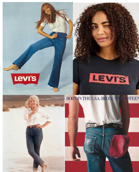
Figure 1: The role of photo models (brand ambassadors) used in Levi's advertisements before being replaced by images created with AI technology

“In my view, as an effort to persuade in promotion or advertising, the existence of a public figure model ambassador is still important or necessary for the appeal of advertising and is an effort to persuade potential consumers. So, if the advertising model is made with AI, I don't really agree (sreg)....” (Interview, 9 June 2024).