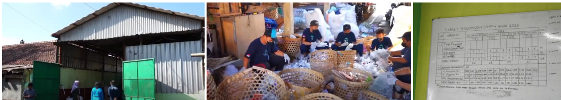
Figure 1. The TPS3R Giwangan building, waste sorting activities, and waste volume data.

The TPS3R building adjacent to the Giwangan market is in the southern part of Yogyakarta. Inside this building, in addition to collecting waste, there are also waste sorting activities carried out by the employees. The TPS3R manager also uses a small office. On the blackboard mounted on the office wall, some data mentions the amount of waste that enters this TPS3R and the efforts to reduce waste and further process waste into new materials. Many types of waste are coming in, the most common being organic waste and the second being non-organic plastic, paper, glass, and metal.