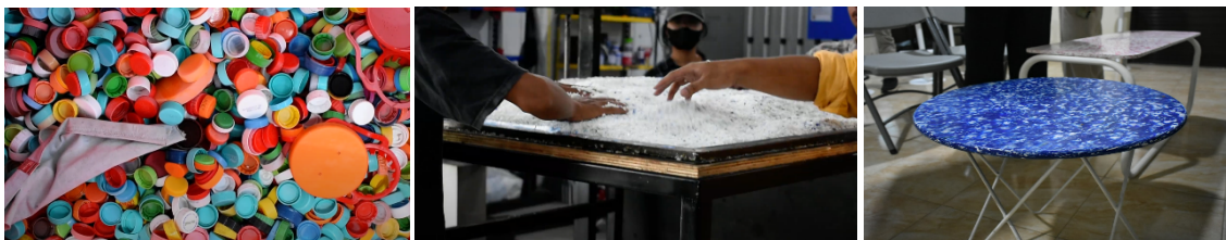
Figure 2. Plastic waste from bottle caps, plastic pellets ready for processing, furniture made from repurposed green materials.