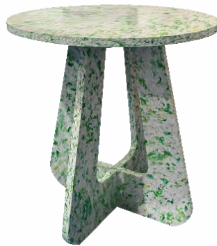
Figure 4. Prototype furniture made from repurposed green materials produced by the industry PT. Inamas Sintetis Teknologi.

At the top is a table containing the design steps, including the research and development of the shape idea. The table details the activities undertaken at each stage, the working methods applied, the partners involved, and the location and time of implementation. Each step in the design process is explained in detail, providing clear guidance from start to finish. In addition, the table also includes collaborations with external partners to support the success of each stage. Below the table, the five furniture designs produced by the students in this project are listed, demonstrating their creativity and ability to create innovative pieces.