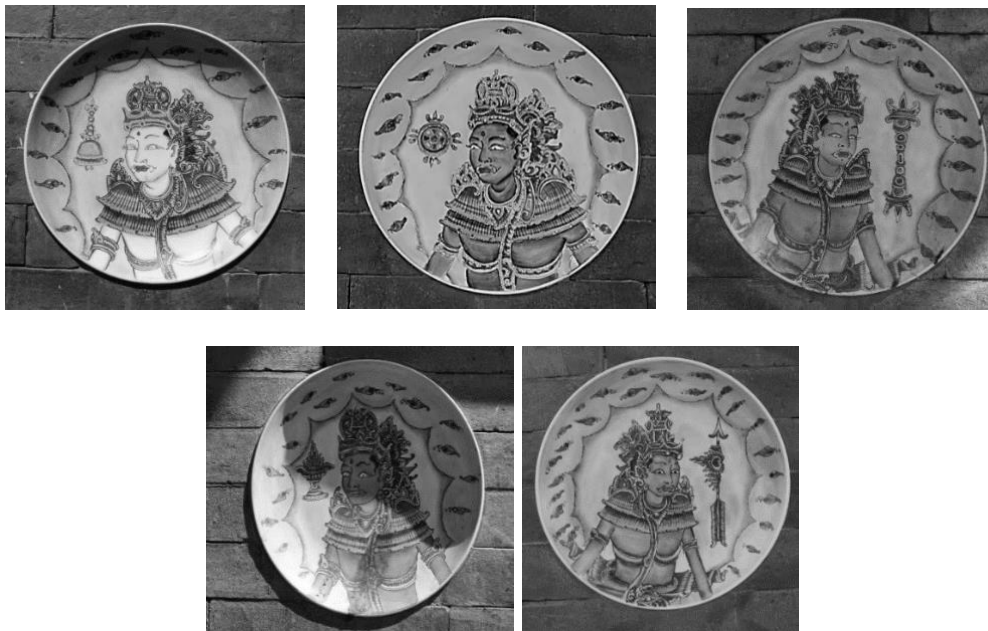
Figure 2. The porcelain ornament of Dewata Nawa Sanga is the Main Symbol of Angga which is installed at the head of the temple.

The idea of porcelain ceramics in Petitenget Temple is internal from Pengempon Petitenget temple, penglingsir Puri, pemangku, and local traditional leaders in the body of the pelinggih installed porcelain ceramic plates with the motif of puppet characters reflecting human relationships with humans so that harmony and balance occur. At the foot of the pelinggih or the lowest base, a porcelain ceramic plate with plant motifs is installed, reflecting the relationship between humans and the underworld or Palemahan. The installation illustrates the harmony between humans and, the environment.