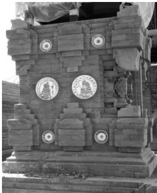
Figure 3. Kamasan Wayang porcelain ceramics with Deities motifs at Petitenget Temple

In essence, this research endeavors to unveil the intricate nuances of acceptance surrounding Wayang Kamasan porcelain ceramics at Petitenget Temple. By delving into the background reasons, motif variations, and material compositions, it seeks to illuminate the profound interplay between tradition, innovation, and cultural identity. Grounded in the Tri Hita Karana concept, which encapsulates the harmonious coexistence of humanity, divinity, and nature, these porcelain ceramics transcend mere aesthetic adornments to become conduits of spiritual enlightenment and cultural connectivity within the sacred precincts of Petitenget Temple.