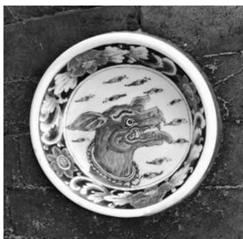
Figure 4. Kamasan Wayang porcelain ceramics with animal and plant motifs at Petitenget Temple

Sociocultural acceptance theory is a theory used to analyze the role played by society in encouraging individual development and growth. Cultural learning is largely a social result and process emphasized in acceptance theory (Syawaludin, 2017). Petitenget Temple is in accordance with the Ariqoh theory. The community accepts and responds well to the porcelain ceramics with Wayang motifs on the pelinggih at Petitenget Temple. Meanwhile, stimuli from outside the subject are active and passive responses. Passive responses are internal responses that occur within humans and cannot be seen directly by other people. Meanwhile, active responses are attitudes/behavior that can be analyzed directly (Cecep, 2013).