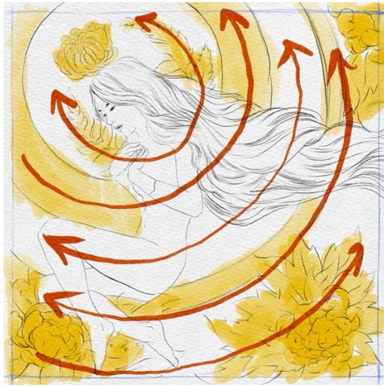
Figure 4. Use of the principle of rhythm from the direction of movement of visual objects

illustration, creating a harmonious and cohesive appearance, as depicted in Figure 3.