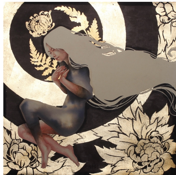
Figure 8. Woman

The illustration also incorporates the symbolic use of the halo as a symbol of grandeur and spirituality and the peony flower as a symbol of beauty and fertility. The use of gold in the illustration also depicts eternal luxury and beauty.