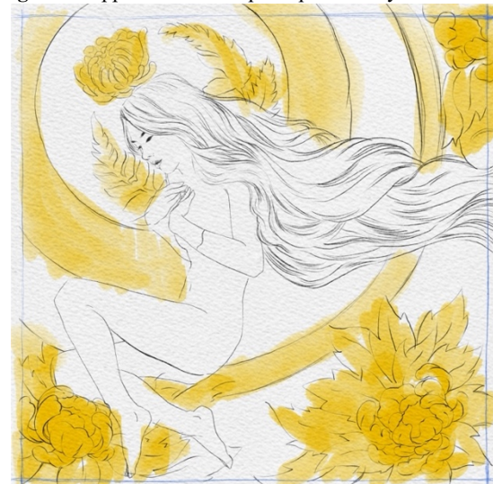
the direction of visual objects

Several fundamental art principles have been applied in crafting this psychedelic-themed illustration featuring a female subject. Unity is evident through the consistent use of peony motifs and the golden colour scheme throughout the