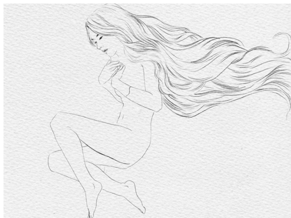
Figure 1. A female subject is used in this illustration

The main subject of this illustration is derived from the performer of the art piece Rhythm 0, a woman. This choice aims to depict the power and serenity of a woman amidst a harsh and noisy environment. The woman's position in the illustration, showing humility and surrender, aligns with the theme of the illusion of power that the piece seeks to convey, as shown in Figure 1. Thus, using a female subject in this illustration carries a solid symbolic meaning related to the theme.