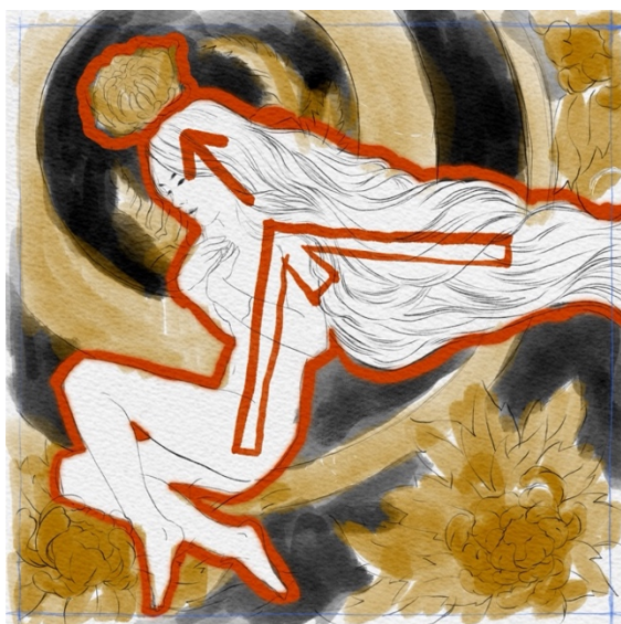
Figure 5. The application of the principle of dominance lies in the female subject and the peony flower object

The principle of rhythm is prominently applied in this illustration, mainly through the strategic placement of golden peonies above the woman's head, which appears to dance gracefully as if performing a choreographed dance. This dynamic arrangement conveys a sense of movement and rhythm within the illustration, creating a lively and engaging visual experience. The circular direction and flow of the elements in the painting further enhance this rhythmic quality, adding to the overall dynamic and rhythmic impression conveyed by the artwork, as depicted in Figure 4.