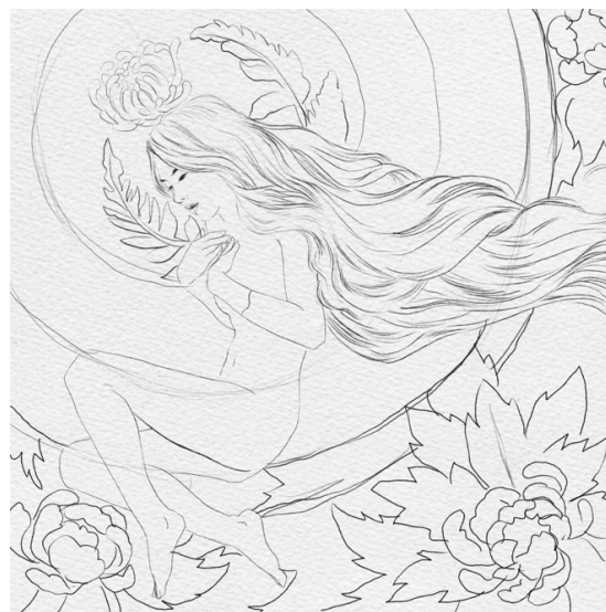
Figure 2. Arrangement of visual elements to accompany the main subject

conveys a sense of firmness while also demonstrating humility, respect, and submission to a higher power. The floating golden peony crown above her head adds an element of elegance and beauty to the illustration.