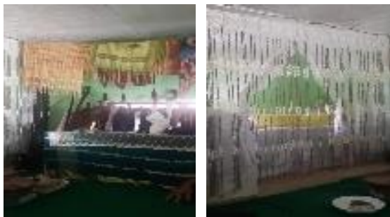
Figure 5. Sacred Tomb of the Owner Gong Rénténg Pusaka Langgeng

When we were going to do research, Abah Soma took us to visit the sacred tomb with the intention of making a rekés ( request ) or request to the first generation Gong Rénténg owner who had died. The condition of the tomb is well preserved covered with white mosquito nets, and several Gong Rénténg waditra and some utensils are neatly arranged on top of the sacred tomb. If the rekés is approved, then the next step is to determine when the Gong Rénténg can be sounded as well as how the activities are structured.