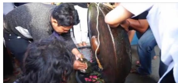
Figure 3. The head of Kedungsana Village was the first to wash the waditra

If various types of flower water are available, then the gamelan bathing event is started by a community leader as shown below;