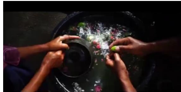
Figure 2. Prepared flower water

After the wrapped gamelan is placed, then some community members provide water sprinkled with several types of flowers / flowers to start the gamelan cleansing ritual;