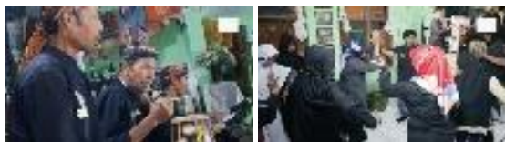
Figure 6. Presenting Gong Rénténg Pusaka Langgeng

The activity seen in figure 6 above is almost most of the perpetrators are relatives in one lineage (no other party should be held) and the time is carried out on 12 Maulud 2019. Such results can be held if permission is obtained during the previous rectés , of course, with a number of conditions that