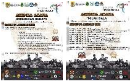
Figure 7. Sarasehan and Reject Bala Theme Poster