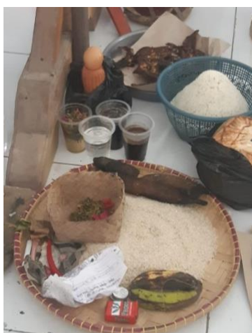
Figure 9. Offerings for rituals at the festival site

In a way to convince Gong Rénténg's fanatical group of traditional rules, the group of young men managed to exceed expectations. Although some Gong Rénténg groups had to leave their habitat (because it was taboo to go outside the habitat), they worked around this by first performing rituals to ask for permission and safety. Some are in their place of origin and some are done where the festival takes place, such as the example below: