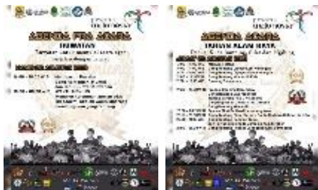
Figure 8. Ruwatan Theme Poster and Nature Dance

In a way to convince Gong Rénténg's fanatical group of traditional rules, the group of young men managed to exceed expectations. Although some Gong Rénténg groups had to leave their habitat (because it was taboo to go outside the habitat), they worked around this by first performing rituals to ask for permission and safety. Some are in their place of origin and some are done where the festival takes place, such as the example below: