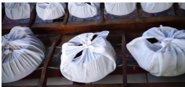
Figure 1. Waditra wrapped in shroud (white)

The next development, the art with a series of gamelan arrangements ( ngarénténg ) was used as a profane means of entertainment, but the ways before playing it had to go through several series of sacred rituals. As done by the people of Kedungsana Village, Cirebon Regency, where there is a name of the Gong Rénténg group named Ki Muntili (the name of the previous group owner), every year a ritual is held to wash and clean the gamelan. The series of rituals carried out by them believe that they can make blessings (get blessings) from the event by means of the remaining water (flower) used to bathe Gong Rénténg Ki Muntili if used for bathing or washing the face, has benefits for their lives. The event began from parading almost all waditra (the name of musical instruments in West Java) that had been wrapped in shrouds (white), then placed in a large enough area before cleaning the 7 kinds of flower water. The person who first washes one of these waditra is usually a community leader (such as Kelapa Desa ) or an elder figure who is said to be in the area. In the form of pictures can be seen the ritual in question;