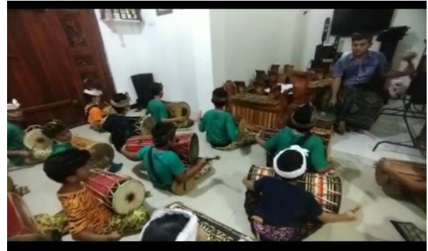
Figure 2. Mekendang (drumming) Tabuh Telu Training Process

the demonstration method is one way of imitating or demonstrating the lessons that will be given. With this method, it can make it easier for students to understand the lessons in the form of gending (song) or drum patterns. This will have an impact on the formation of a balance between the right brain and left brain so it will affect the intelligence of children in receiving material.