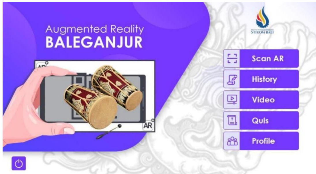
Figure 1. User Interface Design Display Main Menu Application Augmented Reality Baleganjur.

A detailed discussion of Paul Ricoeur's hermeneutical analysis can be broken down into three parts, including: