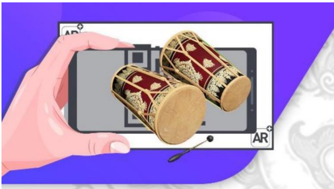
Figure 2. Design Elements in the Main Menu User Interface of the Baleganjur Augmented Reality Application

understanding the meaning contained in design elements, both from the side of the maker and user of the Baleganjur augmented reality application. If it is related to the definition of design, there needs to be elaboration to be able to explain what good design is so that users can easily understand the intent to be conveyed by the maker of these design elements ( Hertenstein, 2013 ).