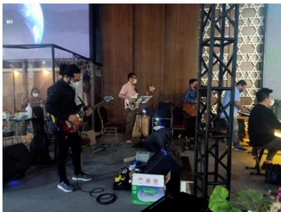
Photo 02. Higher Than Ever Church Music Service Team (Researcher Observation 12/12/2021)