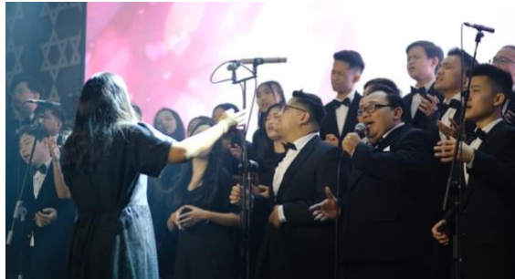
Photo 01. Higher Than Ever Church Choir Team (Researcher Observation 12/12/2021)

Ever Church. The researchers observed the choir, music team, trumpeters, and dancers in the photos below.