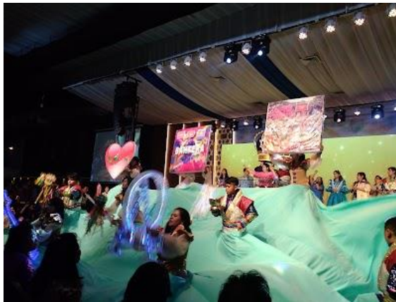
Photo 04. Higher Than Ever Church Dancers (Researcher Observation 12/12/2021)

The Church provides costumes and attributes to dancers in the worship event at the Higher Than Ever Church. According to God's Word, dancers' costumes and attributes, such as heart shapes, flags, winged costumes, and many more, are prophetic. Things that dancers do has been taught to them as part of the Church's dancing team.