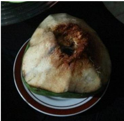
Figure 6. Coconut

The coconut symbolizes countless benefits for life. Here, the coconut is just its result/fruit, but if we look at the entire coconut tree, everything from the roots to the fruit has its own benefits. Additionally, the coconut tree is a metaphor for the sun, with its leaves as the radiating light and the coconut fruit as a symbol of the arrangement of planets orbiting around it. The presence of coconut in offerings symbolizes the Earth. Coconut holds the meaning of kala (time) and pa (space), hence 'kalapa' means space and time (Akmal et al., 2020; Miyaura et al., 2015).