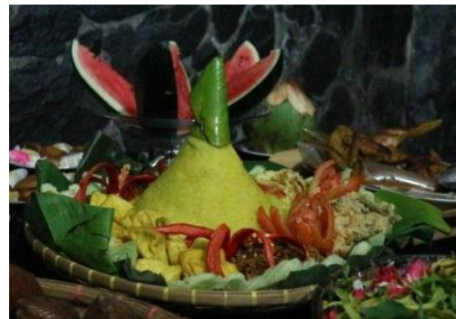
Figure 1. Tumpeng

The cone-shaped tumpeng, narrowing as it goes upward and reaching its highest point in the Sundanese language, is referred to as "siloka nyungcung." This symbolizes that we should seek and pray to the one and only who is positioned at the highest level, above the majestic Creator. In addition to its form, the food inside the tumpeng is also a gift presented in the form of natural produce that can be utilized by all humans. Furthermore, the tumpeng also symbolizes a mountain, which is one of the sources of all-natural resources, ranging from springs to agricultural products (Iktarastiwi & Marwanti, 2022; Pertiwi, 2023)