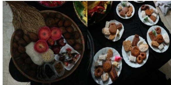
Figure 4. Fruits, Legumes, Rice, Cake

Fruits, legumes, Rice and cakes from the traditional market are all products of nature and human efforts that can be enjoyed by everyone. They can be symbolized as follows: rice and legumes symbolize seeds, fruits symbolize a fruitful outcome, and cakes represent a processed form. This explanation can be summarized as seeds (rice and legumes), outcomes (fruits), and processed products (cakes). It can be interpreted as a reflection of the human learning cycle, where humans are the main seeds. These seeds of knowledge are nurtured from childhood through education by parents. Subsequently, the knowledge gained is processed by sharing the goodness of that knowledge, even if it's just a single sentence of kindness (West & Budgen, 2020)