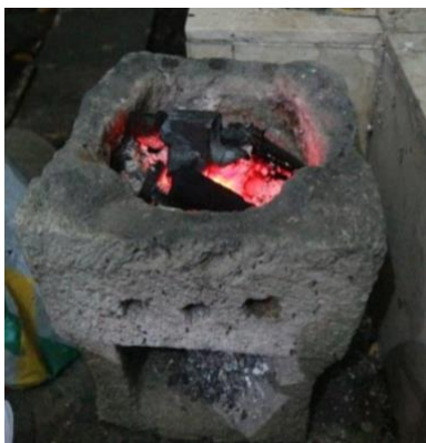
Figure 3. Frankincense

The fragrance of frankincense smoke symbolizes the unity of determination and steps that manifest into something that can bring goodness or benefit (fragrance) to oneself and others. The burning of frankincense clearly produces aromatic smoke, signifying the sensory medium connecting the human world with the cosmology of the higher world in contemporary belief systems (Sumardjo, 2013). Moreover, incense indirectly symbolizes through black-colored charcoal, when burned it produces red flames, followed by yellowish incense, then white-colored smoke emerges, and finally, a pleasant aroma is perceived. The cycle of burning charcoal and incense is laden with meaning in the journey of life, where in facing challenges, one