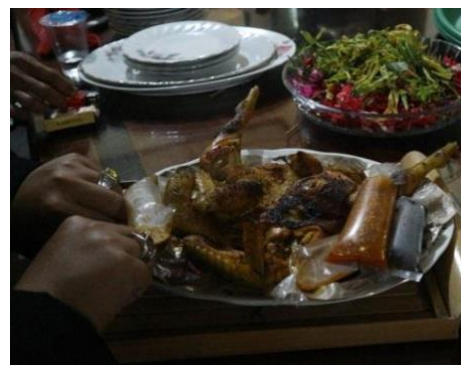
Figure 5. Roasted bakakak chicken

Roasted bakakak chicken, cooked whole, symbolizes sincerity towards the Almighty or surrendering both soul and body in the journey of life while being on His path. Regardless of the challenges given, one remains grateful for what has been bestowed (Guo et al., 2018; Jayasena et al., 2013; Shubar et al., 2019)