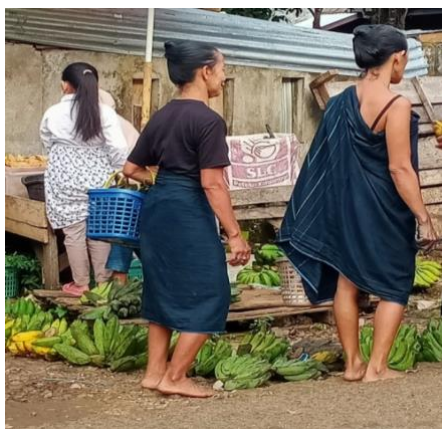
Figure 3: Shopping at the market wearing a sarong

The Ilalang Embayya inhabitants are easily recognized by the attributes of black clothing, such as shirts, pants, sarongs, and headbands (headbands). The black sarong is still worn even when they shop at the market (Figure 3). The black sarong is produced by women using traditional looms. One sarong was finished in one month, starting with yarn coloring (mixing indigo leaf sap, stove ash, and lime) and weaving (Figure 2) (Mina, interview, August 2020).