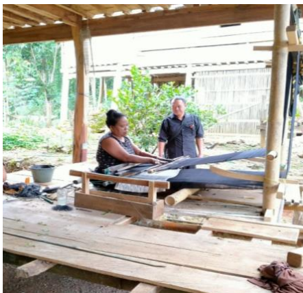
Figure 2: Weaving black sarong

Houses in traditional areas have earthen floors and wooden planks. The ground floor is used for weaving (Figure 2), pounding rice, and for livestock. The wooden plank floor is 2 meters high as the main residential space which can be expanded when there is a party or traditional ritual. A simple stilt house has 16 pillars (12 poles on the edge and 4 poles in the middle) with an area of 54 m 2 (6 m x 9 m). The houses are made of wood, bamboo, and thatch leaves. Damaged or weathered poles can be replaced without tearing down the house. Roofs and walls made of clay should not be used because only the dead have roofs and earth walls.