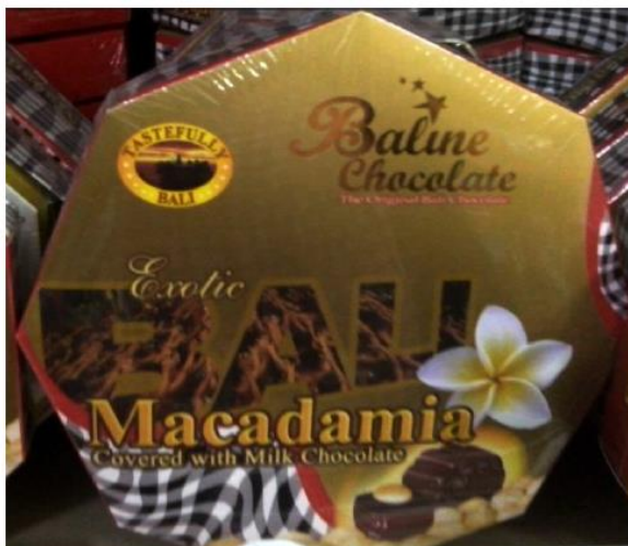
Figure 14. Baline Chocolate Product Packaging.