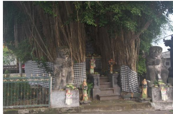
Figure 10. Poleng motif wrapped around a tree

will not dare to do it. This is done as a form of respect and gratitude to the tree that has provided balance to the universe. So that it can be said that normatively the use of the poleng motif on large trees in Bali has meaning as an effort to control people's behavior so that they are not arbitrary towards the environment (Suda, 2010).