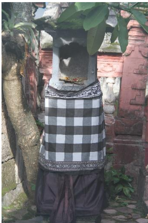
Figure 12. Palinggih Penunggun Karang

Poleng motifs are also wrapped around the palinggih . The word palinggih means the sacred building where Sang Hyang Widhi resides, His manifestation or the holy spirit of his ancestors ( Atma Siddha Devata ). At each temple, there are usually three criteria for palinggih , namely the palinggih utama (main), palinggih pengiring (accompaniment), and additional palinggih . The most important of these are palinggih utama for Sthana Sang Hyang Widhi, Gods, and Bhattara (ancestors) who are especially in that temple. The palinggih pengiring ( accompanying) is for Sthana Deities/Bhattara-Bhattari which functions as an accompaniment to the Deity or Bhattara at the temple, while additional palinggih is a palinggih that is added later to the temple (Titib, 2003:103). The palinggih that are usually wrapped around the poleng motif are the accompanying palinggih . The palinggih are palinggih jungun coral (a sacred building that functions as a guardian of the house yard), palinggih ngerurah (one of the sacred buildings in mrajan/upstream of the house yard), palinggih pasedahan (one of the sacred buildings in the temple), palinggih ulun pangkung (place shrine at the edge of a ravine), palinggih at a crossroads, and other palinggih that function as places of worship for God in His manifestation as guardians.