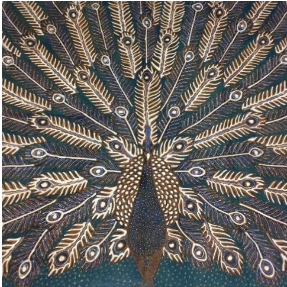
Figure 2. Animal Motifs (Source: https://shopee.co.id/Batik-tulis-warna-alam-motif-Merak-i.123936045.1883666445 , 29 April 2022)