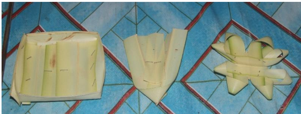
Figure 7. (left-right) Canang Ceper , Canang Tuk-ituk , Canang Sari

The Balinese Hindu community recognizes three forms in their daily religious rituals, namely round, rectangular and triangular. The implementation of these forms can be seen in the bebatenan facilities made by mothers in carrying out their religious rituals. The ingredients in this case are canang sari , flat canang , and canang ituk-ituk .