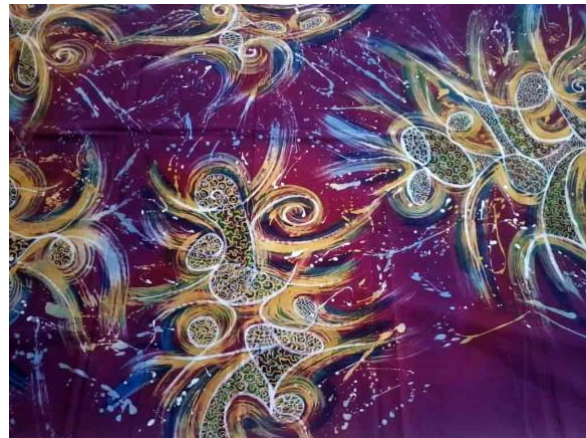
Figure 5. Abstract Shape (source: https://produsenkainbatik.wordpress.com/2015/10/26/jual-kain-batik-motif-abstrak/kain-batik-motif-abstrak-merah-marun-keunguan-0857-9923-0634-2/ , 29 April 2022)

The abstract form is a free imagination that is realized from an unusual form, or the embodiment of a form that has no resemblance to various objects, both natural objects and man-made objects. In other words, an abstract form is a formless (unreal) design.