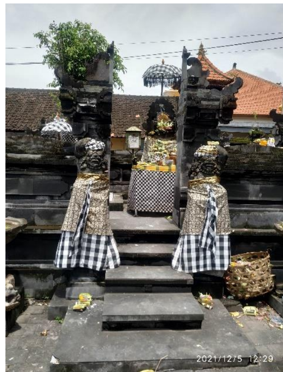
Figure 11. Dwarapala statue

The poleng motif wrapped around the Dwarapala statue has the meaning of repelling bad luck. In Hindu society, there is a special distinction between statues and statues. A statue is an object that is three-dimensional in shape resembling a god or a giant that has not fulfilled the ritual requirements of Hinduism. Meanwhile, the statue on the other hand is an object that can be used because it fulfills the requirements of Hindu religious rituals.