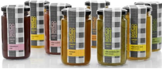
Figure 13. Product of Awani Bali

identity in the form of cultural objects that are commonly used by Balinese people as corporate characteristics (Sari & Ari, 2013).