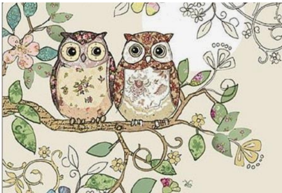
Figure 3. Stylized decorative shape

Forms of design that come from nature, are transformed into decorative forms with stylizations (compositions) into fashion and fantasy (usually supported by various variations and beautiful and harmonious arrangement of color nuances). Stylized decorative forms are usually the same as stylized animals, plants, and people. An example of a decorative shape is shown in the image below.