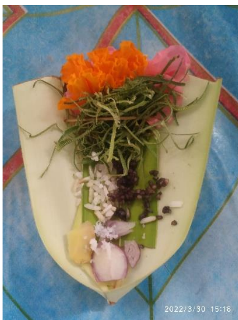
Figure 9. Segehan poleng

Apart from canang , Balinese people also know segehan poleng . Segehan poleng is usually offered at the tugu penyarikan and the tugu Penunggun Karang using the following ingredients: leaves or coconut leaves as the base, black and white colored rice where black rice is made from black rice with side dishes of onions, ginger, and salt. The two colors of rice, namely black and white, are symbols of Rwa Bhineda , namely two different and inseparable powers. Hindus carry out ceremonies using this segehan with the intention that good (white) forces and evil (black) force balance so that harmonization is established that can create a balance in the universe (Adnyana & Watra, 2017).