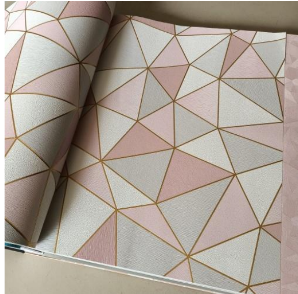
Figure 4. Triangle Motif

These designs are based on geometric elements, such as rectangles, circles, ovals, squares, triangles, hexagons (various facets), cones, parallelograms, cylinders, and various lines.