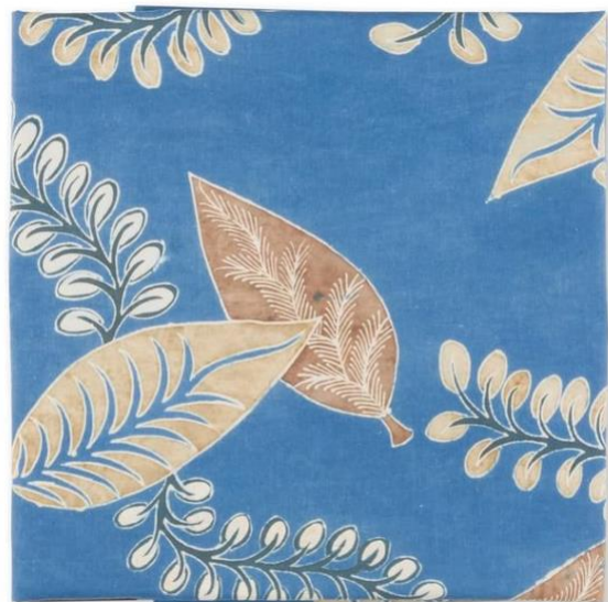
Figure 1. Leaf Motif

This form of design is very strongly influenced by natural forms of objects or forms that are characteristic and tangible from nature and whose depiction is very similar to natural objects such as leaves, fruits, flowers, plants, rocks, wood, skin, clouds, rainbows, stars, moon, sun, and various figures (animals and people).