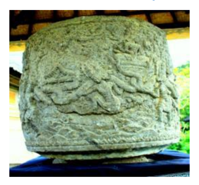
Figure 1. Sangku Sudamala decorated with Samudra Mantana Relief

The vessel with Samudra Manthana relief was related to the purification concept which involved the sacred characteristic of water, and the power of rwa bhineda (Sura-Asura) in the process of purification itself. The purification concept here was basically about spiritual, not about moral or physical matter. Understanding the major meaning from the power of water which was considered to have ability in replacing any forms of ritual. Weda (Hindu's holy book) identified water as the core of spiritual treatment or the first door of spiritual treatment or even the process to reach the immortality (Joshi, 2001, p.3). Furthermore, this became the principal of Balinese in behave as it was believed that water is the manifestation of Lord Wisnu thus they respect the existence of water, protect it and preserve it and also purify it. These are realized by building pelinggih (a holy place), maintaining the vegetation, and doing spiritual management as can be seen in Pekerisan and Patanu watershed (A.G.Bagus, 2008).