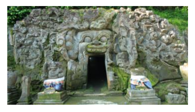
Figure 3. Front Faced Goa Gajah Relief

Besides it, the existence of the image of kala is also described the figure of forest guardian which is called Banaspati (Badra, 2012).