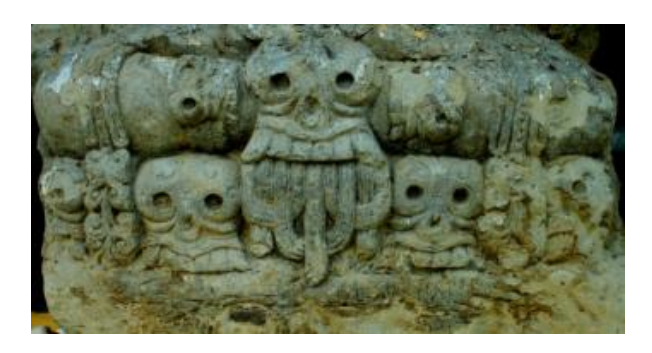
Figure 4. Bhirava Relief in Kebo Edan Temple

Although the name Bhairawa is translated as something scary and frightening, the interpretation is different. Bhirawa men God who protect His worshippers from their inner enemies as well as the outer ones such as greediness, desire, anger and other negative emotion. Bhairawa comes from the word Bha which means creation, Ra which means conservation, and Va which means destruction. Therefore Bhairawa is believed as the highest goddess, it integrated all the power in this universe to reach freedom (Chopra, 2019, p.211). A similar thing also be seen in the manifestation of Durga Mahisasuramandini who was suspected as the wife of King Udayana, Mahendradatta (Badra, 1993) from the characteristics of the relief shape, the statue was by the description of Dewi Durga in Her form as Durga Mahisasuramandini in the mythology of Hindu, the standing posture seems to dance on the buffalo's back, she brings various attributes as the deity of war, and the symbol of dharma's victory.