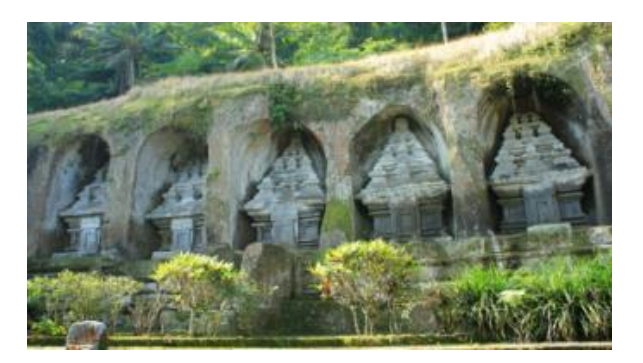
Figure 2. Candi Gunung Kawi Cliff Relief

and their people and with the priests which did tapa and semadi there.