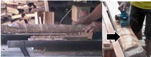
The waste from Coconut Tree ( sebetan/bahbir ) saw mill.