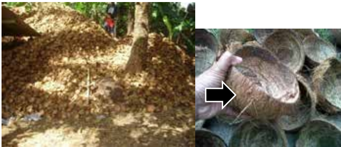
Surrounding area Natural Resources (Coconut Shell)