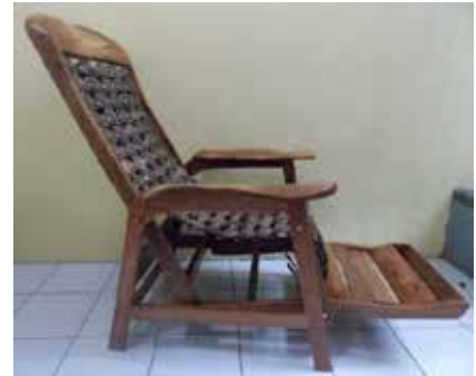
Thematic Design Product: Relaxing Chair