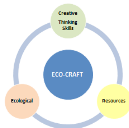
Figure 01: Eco-Craft (made by researcher, 2014) 1

Referring to table 01 attached, this research method in focused on craftsmen as an individual actor and social with practical perspective point (1), (3) and (4) within the scope study of technical and practical science occurs in home industrial furniture of Pangandaran and its surroundings. ECO-CRAFT approach: creative thinking skill, ecological and Resources become “ guide line ” in identifying structure of local craftsmen’ creative process in the hope and achievement result oriented to IP or IPR reputation. While the measurement indicator and direction on the quality of furniture production employed function theory perspective (Victor Papanek, 1995) that covers; needs, functionality, association, Telesis, and esthetics.