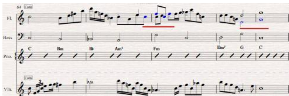
Figure 8. The process of revising the coda melody part

The fifth step is evaluation and revision, arrangements arranged following the desired musical structure. They then listened back to in detail so that parts that are considered less relevant can immediately be corrected or revised by the arranger's will (2013). The process of evaluation and revision of arrangements. Lg. Rangkaian Melati is carried out using Sibelius software so that auditive can be listened to continuously. Continuous listening efforts are carried out so that the musical properties contained in the formal structure of music, such as 'sound intensity, motion: sound rhythm, proportion: arrangement of sounds in rhythm' can be experienced as a whole as material for evaluation and revision (Suryajaya, 2016). Through continuous listening, the author does not find too many parts that need to be significantly revised. Technically the revised results can be seen in Figure 8 by describing the red line and the blue tone. In Figure 8, the red line indicates that revisions are only made to the part, namely the coda melody played by the flute instrument by changing the position of the tone and changing the rhythm pattern slightly. In the 8-tone image given a blue color is a revised tone and rhythm.