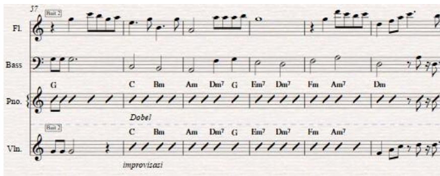
Figure 7. Fillers' improvisation-based manufacturing