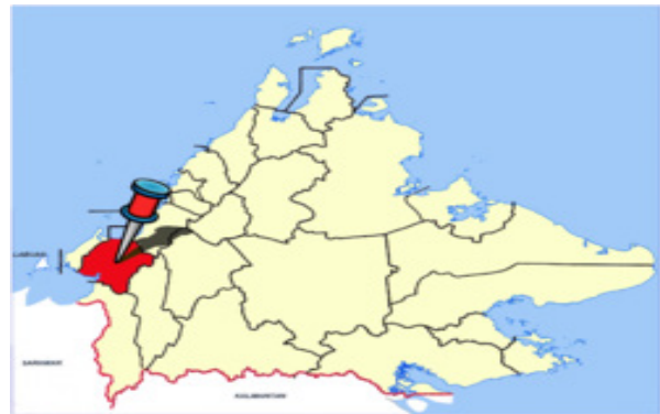
Figure 1: Location Map of the study