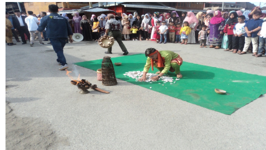
Figure 4. Asyeik Dance

The customary graduation ceremony begins by forming a committee appointed by the Curatorial Board under the approval of Depati Agung (The Great Leader). After the elected committee is formed, this committee will then hold a work meeting later to discuss all the preparations and equipments that will be needed to implement the activities. This graduation tradition actually has several series of activities including the following: