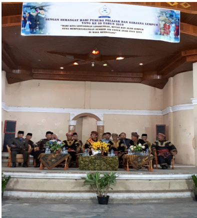
Figure 2. The Tens Leaders

needed as by doing farming is enough for them to earn quite a lot of money.