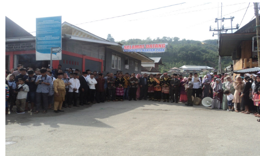
Figure 3. Opening by the Ten Leaders

The customary graduation tradition is carried out annually by a committee appointed by the Curatorial Board. The Curatorial Board consists of Chiefs of Villages included in Lekuk 50 Tumbi Lempur. This Curatorial Board will later be the coordinator of traditional graduation activities.