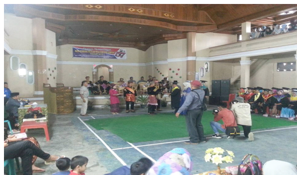
Figure 6. Awards

Some of the series of activities mentioned above have become a routine every year by Lekuk 50 Tumbi Lempur community. The Second of Shawwal is awaited as a big day for prospective graduates.