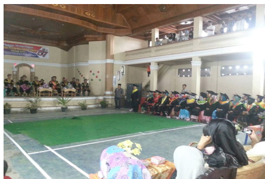
Figure 5. Traditional Graduation Ceremony

The graduation procession will end at the multipurpose building where the event takes place.