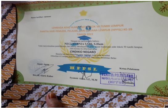
Figure 7. An Example of Cendikionegarо Certificate

pur being proud of in their daily lives. Interpretive theory emphasizes the importance of the particularity of a culture, and holds that the central objective of social study is an interpretation of meaningful human practices. Human-generated culture has a meaning that starts from community interpretation of the culture that is believed and reflected in various forms of activities or activities that they do.