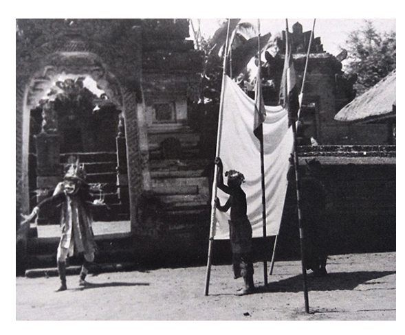
Image 1. The use of white cloth reflectors as reflectors is assisted by Balinese assistants In the process of shooting by Walter Spies

Gericke recommends that the State make a serious effort to study the history and culture of indigenous people (not only Java) so that a harmonious atmosphere and social and political conditions can be created. (Margana, 2018: 4).