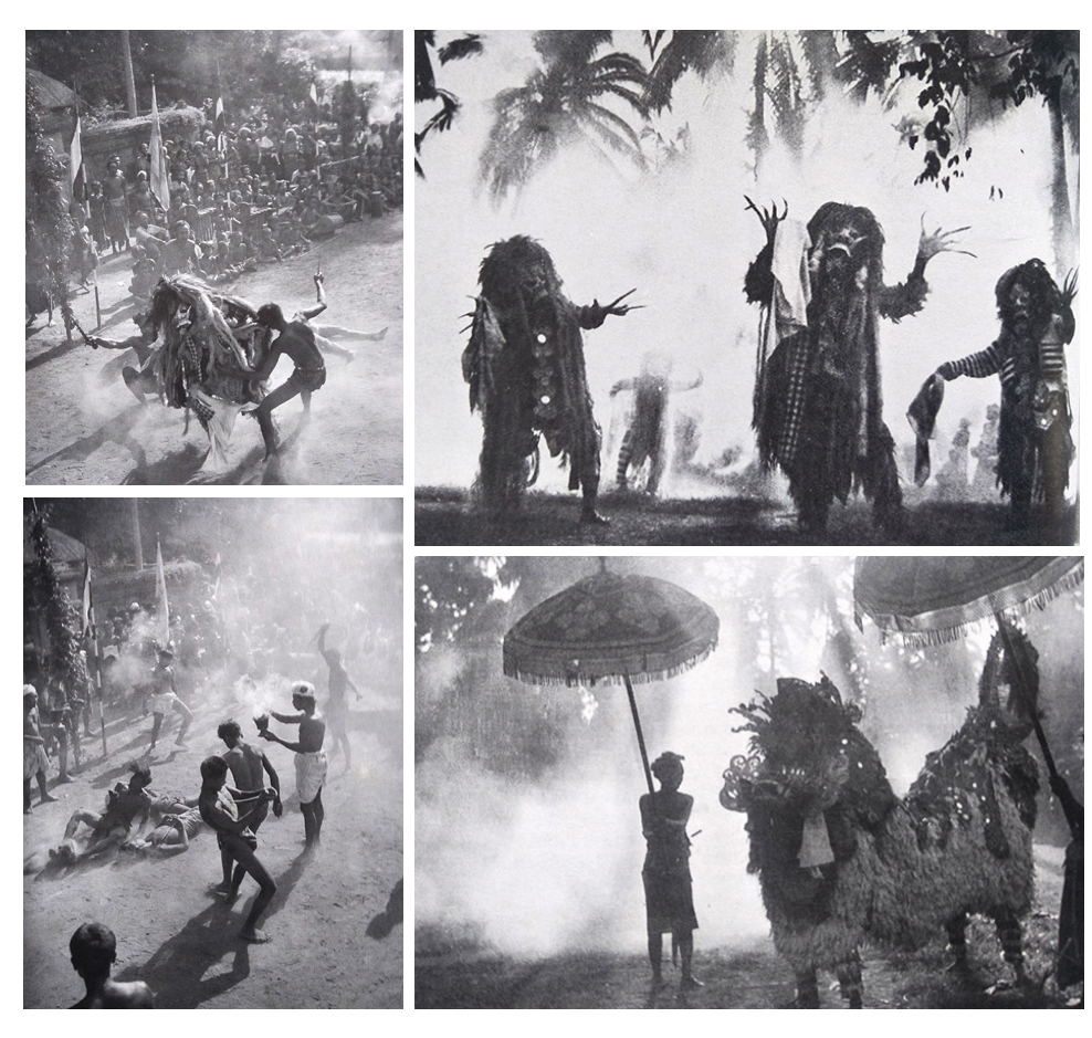
Image 2. The use of smoke effect as a mystical nuance In the process of shooting by Walter Spies

In the smoke effect, the use of back light as a silhouette nuance also appears as a mystical reinforcement in the unity of Walter Spies' photo. In this pose also began to appear kerauhan scenes that do not fully contain mystical, but replaced with mere theater scenes.