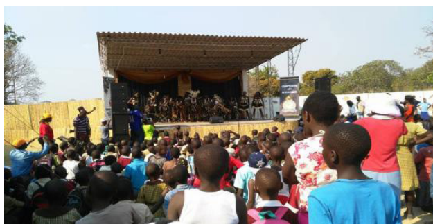
Figure 5. Raised stage used by performers at the Annual Jerusarema/Mbende Dance Festival.

parcel of Jerusarema Mbende cultural material (see Figure 4).