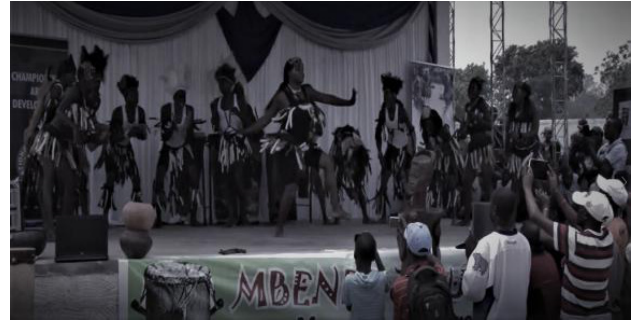
Figure 8. Ngomadzepasi Dance Ensemble performers standing in an arc form whilst a girl performs inside the arc.

Other traditionalists and the junior drummers claim that multiple drums are better than two in terms of the quality of sound and rhythm. Most performers feel that this element adds value to the overall substance of the dance