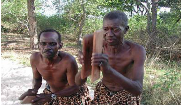
Figure 3. Men playing wooden clappers during a Jerusarema/Mbende dance demonstration performance.