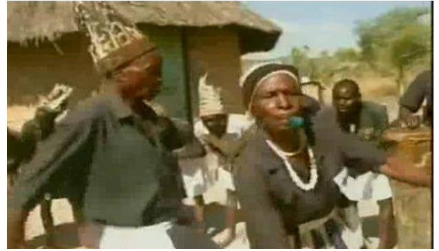
Figure 4. A woman performing Jerusarema/Mbende dance whilst blowing a whistle.

in 2017 concur that Zimbabwean performance contexts currently include recreational centres, political gatherings, competitions, and festival arenas.