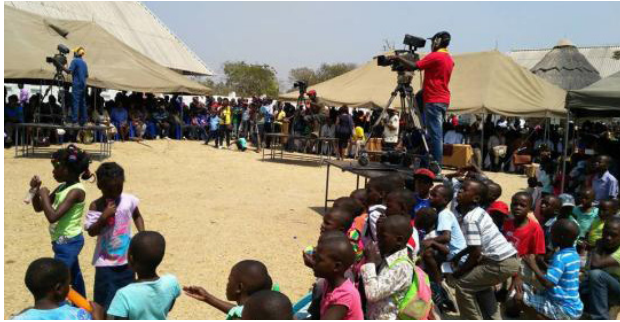
Figure 7. Three tents pitched in front of the stage at Murehwa Cultural Centre.

in the Jerusarema/Mbende dance and must not be omitted. However, innovations have been introduced. For example, whilst watching videos of the Ngomadzepasi ensemble from 2013 to 2015, the authors of this article observed that the men who used wood clappers got a chance to display their wood clapping skill throughout the performance (see Figure 11).