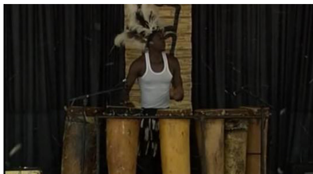
Figure 12. Makarekare master drummer playing six drums during the Annual Jerusarema/Mbende Dance Festival, 2015.