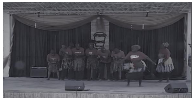
Figure 9. Shingirirai Traditional Dance Ensemble performers standing in a line whilst a female performer is dancing approximately a metre away.