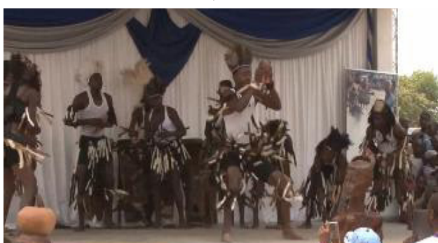
Figure 11. Ngomadzepasi wood clappers showcasing their skills during the rest session at the Jerusarema/Mbende Dance Festival.

lyrics, for example ‘Tirikutandara’ (We are Relaxing) or ‘Yarira Ngoma’ (The Drum is Beating), give meaning to the dance. For instance, the song ‘Yarira Ngoma’ gives the audience some idea of where the dance comes from. Therefore, performers’ interest becomes a priority. The safeguarding of the Jerusarema/Mbende dance may be diminishing as UNESCO cannot control the interests of the various ensembles.