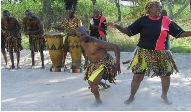
Figure 1. Jerusarema/Mbende dancers demonstrating how the dance is performed.