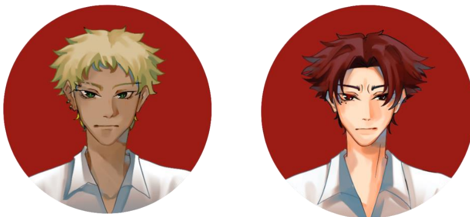
Figure 11. Eka and Agastya close up

Figure 10 introduces two female characters who serve as foils to the protagonist. Distinct visual attributes distinguish these supporting characters. The character on the left possesses short hair and an expressive demeanour, while the character on the right, characterized by glasses and tied hair, exudes a calm disposition. For clarity, the character wearing glasses is named Saras, and the one with short hair is Widya.