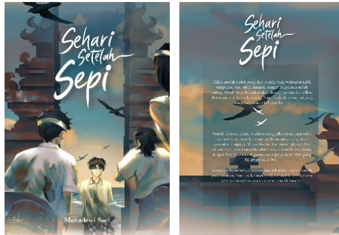
Figure 12. "Sehari Setelah Sepi" book cover