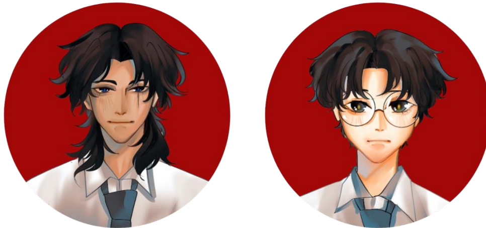
Figure 8. Raka and Yudhi close up