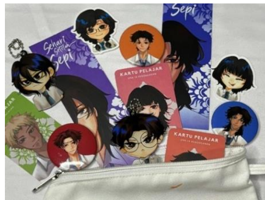
Figure 13. Merchandise product

Promotional merchandise, including bookmarks, keychains, photocards, pins, notepads, and pouches (Figure 13), has been developed to complement the illustrated novel Sehari Setelah Sepi . With visual merchandise, we can create engaging product presentations, stimulate interest, and produce desired displays. This is aimed at captivating and enchanting consumers who view them (Ginting, 2010).