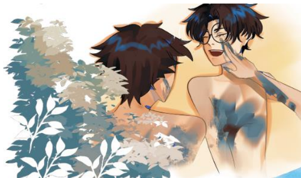
Figure 5. Mebuug-buugan illustration

The illustration in Figure 4 depicts an ogoh-ogoh . Ogoh-ogoh itself represents bhuta kala , typically portrayed as a frightening figure. For Hindus, ogoh-ogoh statues symbolize humanity's negative traits and the universe's negative aspects. After being paraded, ogoh-ogoh is destroyed by burning it during the grand purification ceremony known as " tawur agung kesanga " before Hindus observe the " tapa brata penyepian " austerity.