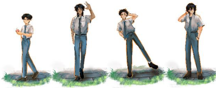
Figure 7. Character fullbody

This character is created based on the diversity of Indonesian society, particularly in Bali, which consists of various skin tones, body shapes, and personalities. As seen in Figure 7, the character is designed to be a teenager to align with the slice-of-life theme of the story and target the Indonesian teenage market aged 17-25, allowing them to relate to the content and conflicts of each character. There are four main characters, focusing on one main character and four other supporting characters.