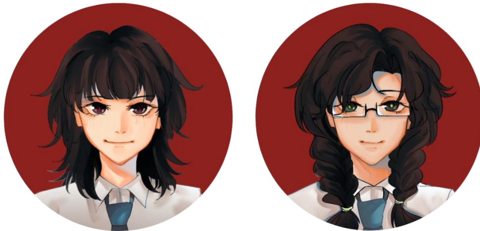
Figure 10. Widya and Saras close up