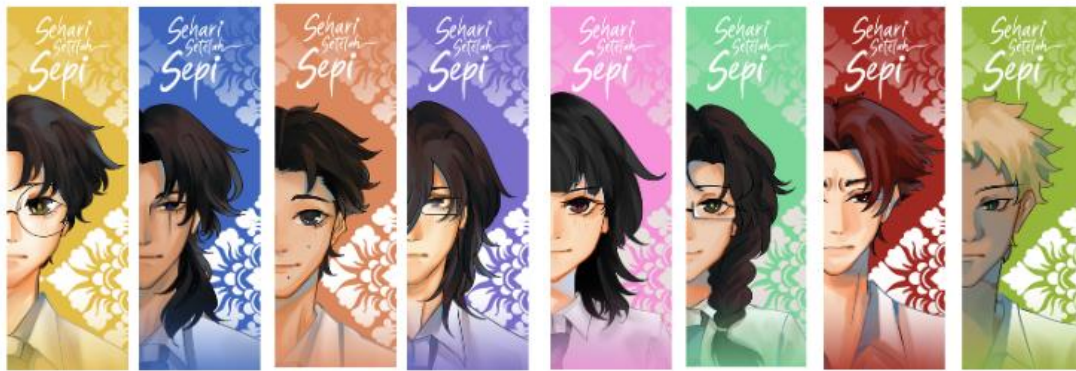
Figure 14. Bookmark design

their traits. For instance, yellow for Yudhi, dark blue for Raka, purple for Yudhistira, orange for Rama, jade green for Saras, pink for Widya, red for Agastya, and lime green for Eka.