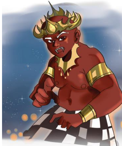
Figure 4. Ogoh-ogoh illustration