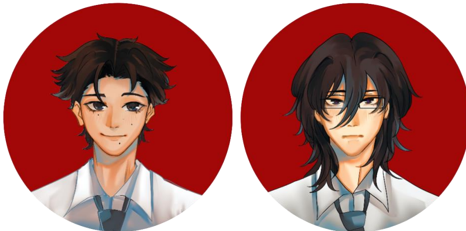
Figure 9. Rama and Yudhistira close up

Yudhi, depicted on the left, is physically characterized by a diminutive stature and distinctive round glasses, which visually correlate with his introverted personality. His body language and written expressions within the novel further reinforce this shy demeanour. In contrast, Raka, positioned on the right, is distinguished by a taller frame, darker complexion, long hair, and facial scars, creating a visually striking and assertive presence. His physical attributes mirror his outgoing and carefree personality, exemplified by his facial expressions and writing style.