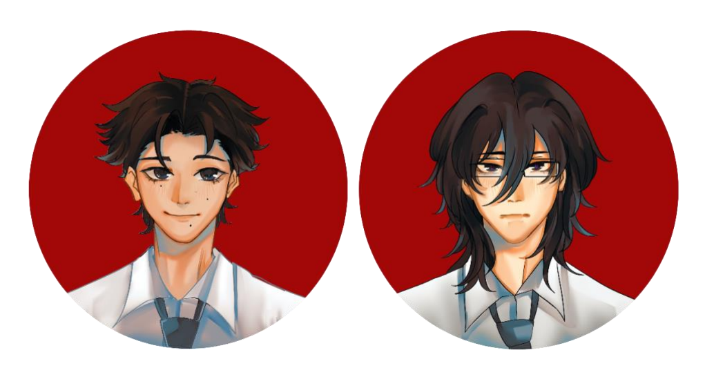
Figure 9. Rama and Yudhistira close up

Yudhi, depicted on the left, is physically characterized by a diminutive stature and distinctive round glasses, which visually correlate with his introverted personality. His body language and written expressions within the novel further reinforce this shy demeanour. In contrast, Raka, positioned on the right, is distinguished by a taller frame, darker complexion, long hair, and facial scars, creating a visually striking and assertive presence. His physical attributes mirror his outgoing and carefree personality, exemplified by his facial expressions and writing style.