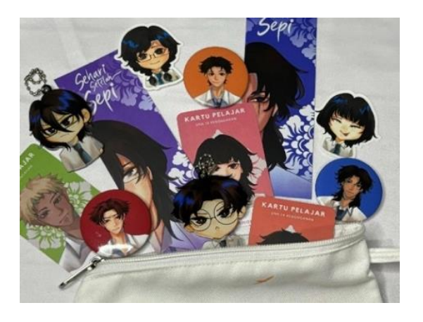
Figure 13. Merchandise product

Promotional merchandise, including bookmarks, keychains, photocards, pins, notepads, and pouches (Figure 13), has been developed to complement the illustrated novel Sehari Setelah Sepi. With visual merchandise, we can create engaging product presentations, stimulate interest, and produce desired displays. This is aimed at captivating and enchanting consumers who view them (Ginting, 2010).