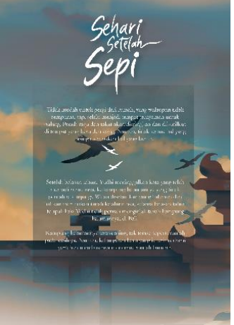
Figure 12. "Sehari Setelah Sepi" book cover

A well-designed novel cover draws in readers with visual cues (Sinaga & Triyanto, 2020). These elements can create a miniature world that hints at the story's content and central theme. The cover, as seen in Figure 12, represents the tradition of "mebuug-buugan" in Kedonganan, Bali. The main character takes the spotlight, with only their face showing, while supporting characters are shown with their backs turned. A character visibly covered in mud signifies the "mebuug-buugan" tradition, which involves using mud. Additionally, the presence of a temple emphasizes the novel's setting in Bali.