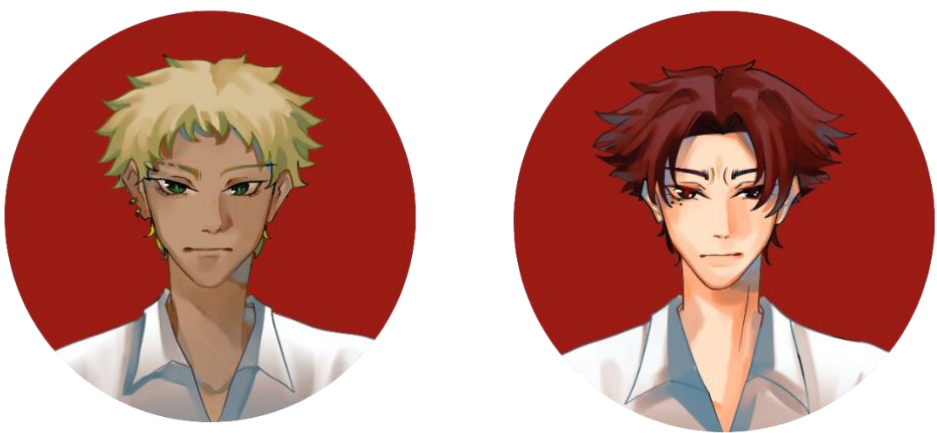
Figure 11. Eka and Agastya close up

Figure 10 introduces two female characters who serve as foils to the protagonist. Distinct visual attributes distinguish these supporting characters. The character on the left possesses short hair and an expressive demeanour, while the character on the right, characterized by glasses and tied hair, exudes a calm disposition. For clarity, the character wearing glasses is named Saras, and the one with short hair is Widya.