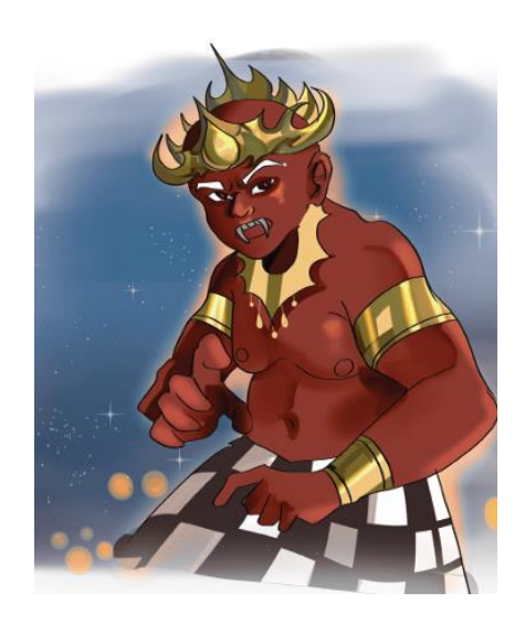
Figure 4. Ogoh-ogoh illustration

The illustration in Figure 4 depicts an ogoh-ogoh . Ogoh-ogoh itself represents bhuta kala , typically portrayed as a frightening figure. For Hindus, ogoh-ogoh statues symbolize humanity's negative traits and the universe's negative aspects. After being paraded, ogoh-ogoh is destroyed by burning it during the grand purification ceremony known as " tawur agung kesanga " before Hindus observe the " tapa brata penyepian " austerity.