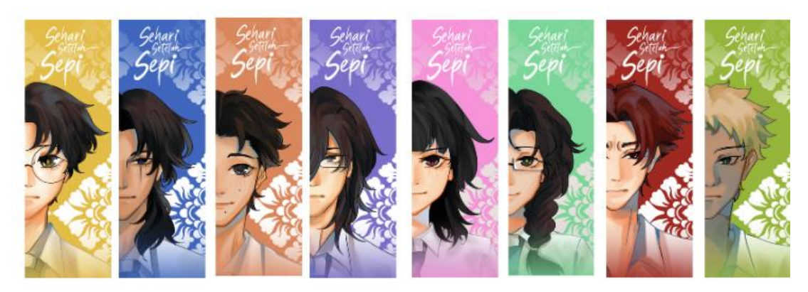
Figure 14. Bookmark design

their traits. For instance, yellow for Yudhi, dark blue for Raka, purple for Yudhistira, orange for Rama, jade green for Saras, pink for Widya, red for Agastya, and lime green for Eka.