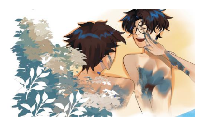
Figure 5. Mebuuq-buuqan illustration

The illustration in Figure 4 depicts an ogoh-ogoh . Ogoh-ogoh itself represents bhuta kala , typically portrayed as a frightening figure. For Hindus, ogoh-ogoh statues symbolize humanity's negative traits and the universe's negative aspects. After being paraded, ogoh-ogoh is destroyed by burning it during the grand purification ceremony known as " tawur agung kesanga " before Hindus observe the " tapa brata penyepian " austerity.