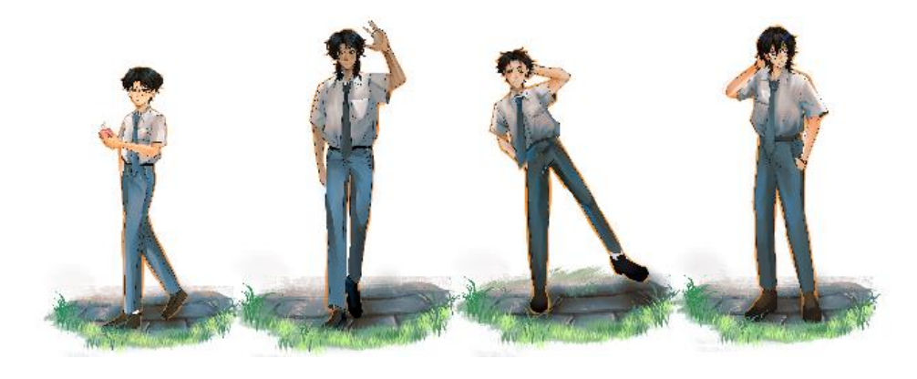
Figure 7. Character fullbody

This character is created based on the diversity of Indonesian society, particularly in Bali, which consists of various skin tones, body shapes, and personalities. As seen in Figure 7, the character is designed to be a teenager to align with the slice-of-life theme of the story and target the Indonesian teenage market aged 17-25, allowing them to relate to the content and conflicts of each character. There are four main characters, focusing on one main character and four other supporting characters.