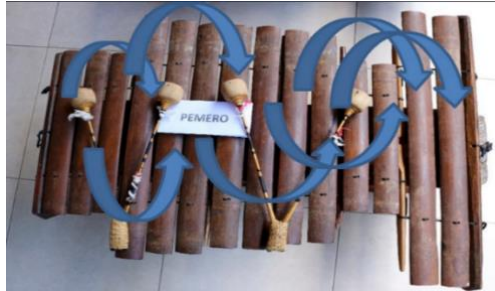
Figure 3. Pattern of Pemero's Xylophone Tones

Gambang Pemero : O A e O A e u a o I u a o I.