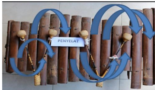
Figure 4. Layout pattern of the insulating gambang tones

Gambang Penyelat : u a o u a o I O A e I O A e.