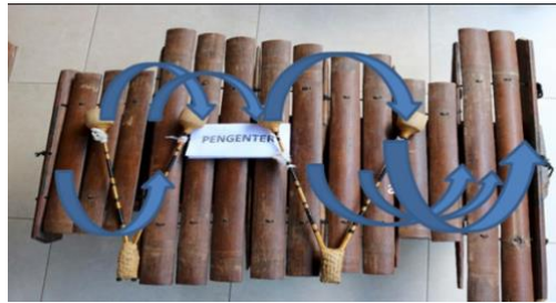
Figure 2. The pattern of the input xylophone tones

Gambang Pengenter : o I O o I O A e u a A e u a.