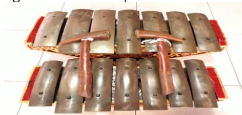
Figure 1. Gangsa Xylophone Instrument

The Gambang Gamelan in the Kwanji Traditional Village consists of two Gangsa stump, namely Penyorog and Pengumbang whose material is made of bronze (Balinese: krawang ) each consisting of seven blades/tones in the order of the notes as follows: