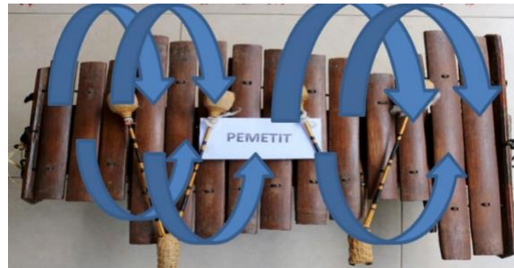
Figure 5. Pattern of the Picker's Xylophone Tones

Gambang Pemetit : o I O o I O A e u a A e u a