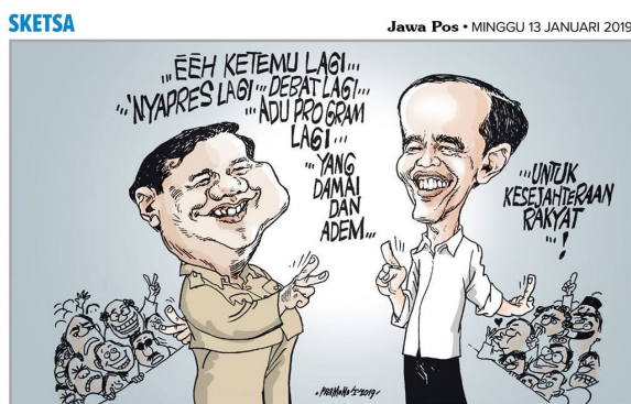
Figure 1: Jawa Pos Sunday Cartoon, January 13, 2019 by Pramono

The political cartoon for the Sunday January, 13 2019 edition of the Jawa Pos newspaper was present in the sketch rubric. This cartoon was created by cartoonist Pramono. This Political Cartoon utilized a one-panel storytelling method, meaning that cartoons did not use a strip-telling method that presents a panel-panel transition. With a panel measuring 10 cm x 17 cm, this cartoon presented illustrations, typography, colors and layouts.