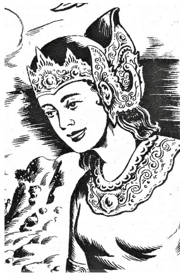
Candrakirana as Panji Semirang, The Female Bodied Feminine Man

perfect disguise of a woman, still as a feminine man, is taken for granted as possible.