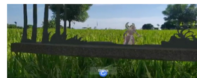
Figure 1 Tetikesan Bima