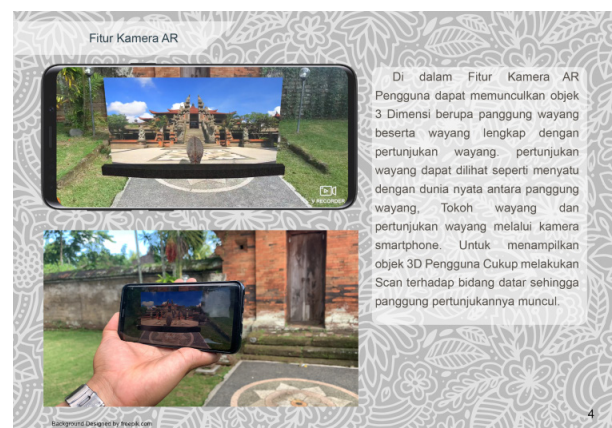
Figure 5.1 AR Camera Features Showing the Stage (Researcher’s documentation, 2020)

The stage is the part of the floor that is higher than the surroundings; higher buildings (Tim Reality, 2008: 488). Meanwhile, Ardiyasa said that the stage in puppet art is a place to place elements of wayang performances (Ardiyasa: 2020: 46). Referring to Ardiyasa’s explanation and Tim Reality, the researcher analyzed the stage as one of the elements that embodies a work of art. The results of the analysis showed that the stage used is flat media of at least 1-2 meters. The stage is determined by the user’s presence and the user’s will. If the user is in the temple, the user can choose the stage in the temple area. If you are at home, users can choose a table, bed or home page as the stage. As can be seen in the image below