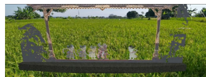
Figure 2 Scenes of Peparuman with a background of rice fields as a visualization of prosperity of the Indra Prasta's kingdom (Researcher's Documentation, 2020)

Selection of forms or genres of Balinese style Pandavas characters to be transformed into AR media. The presentation structure still uses a conventional pattern, namely the opening ( kayonan dance, parwa penyacah ), content ( peparuman , rank and conflict) and closing (resolution). The movement pattern is likened to a traditional wayang movement pattern (adapting to the character), such as pejalan , piles , seledet , ngebah , nayog , nyembah , and nuding . In appearance, it did not completely change the original form of the Panca Pandavas puppet, only the translation of the language from Kawi to Indonesian. In addition, this transformation does not use a screen or white screen, because the AR concept by using a flat space around the user (audience) will be the background of the show.