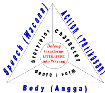
Chart 1. Tri Sandi: A Model of Transformation of Literature into Wayang Performances (Source: Sedana, 2019: 14)