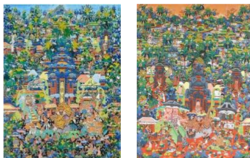
Theme: Kecak and Barong Dances in the Temple